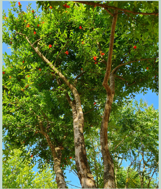
Punica granatum 3.0-3.5m multistem, Summertime

In ancient times, it was used to treat digestion problems. Whereas in recent history, there is evidence that shows it can prevent serious conditions such as heart disease, cancer and diabetes.