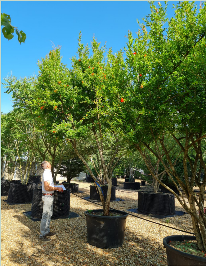
Punica granatum 3.0-3.5m multistem, summertime

Punica granatum is a deciduous, rounded shrub cultivated for its fantastic shape, beautiful flowers and tasty fruit. Perfect as an ornamental tree, its maximum height is around 3-5m high and 4-6m wide.