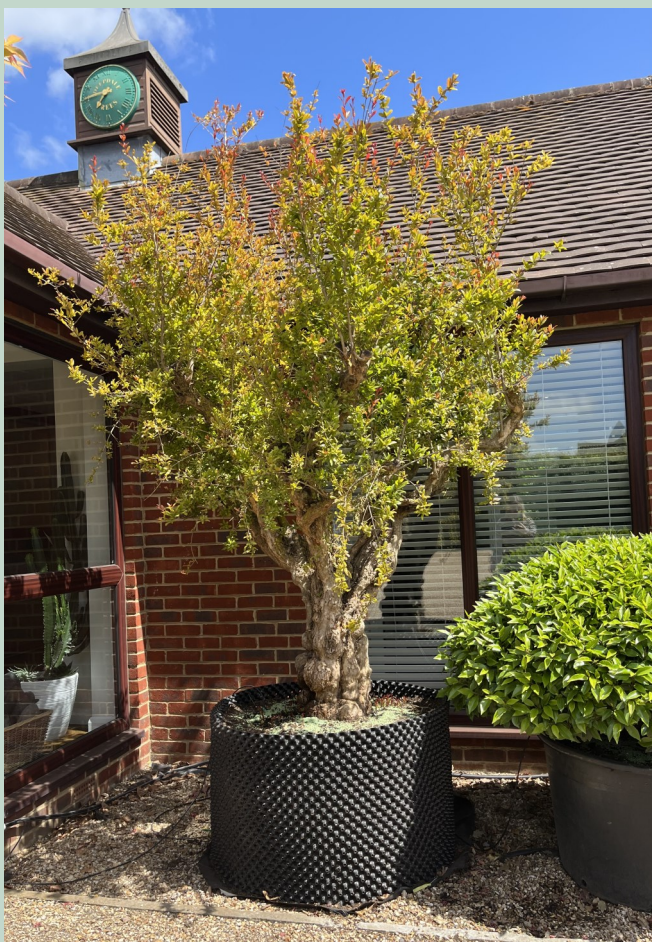
Punica granatum 50-60cm 1/2 stem, Springtime