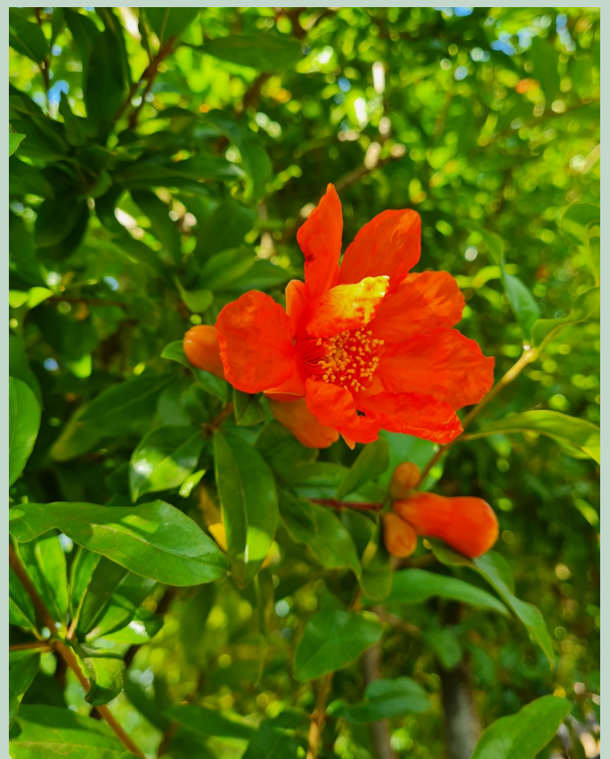
Punica granatum flower