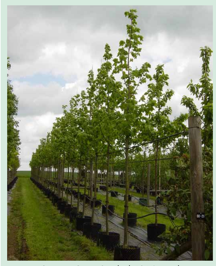
Container Grown Standard 12-14cm girth