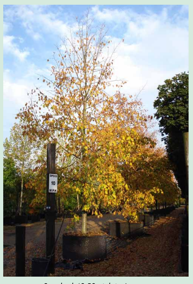
Standard 40-50 girth in Autumn