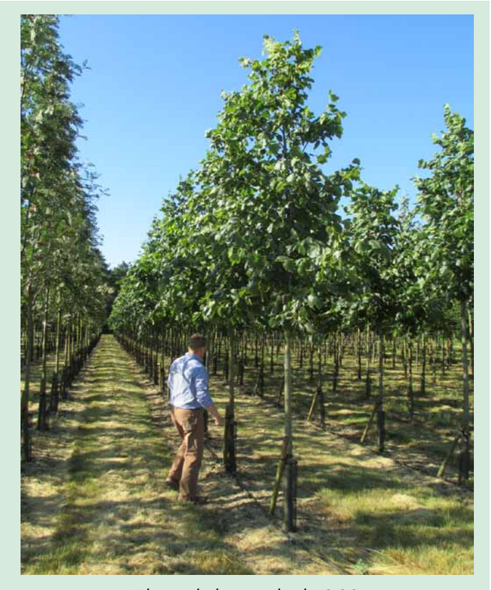
Tilia eucholra standard 18-20