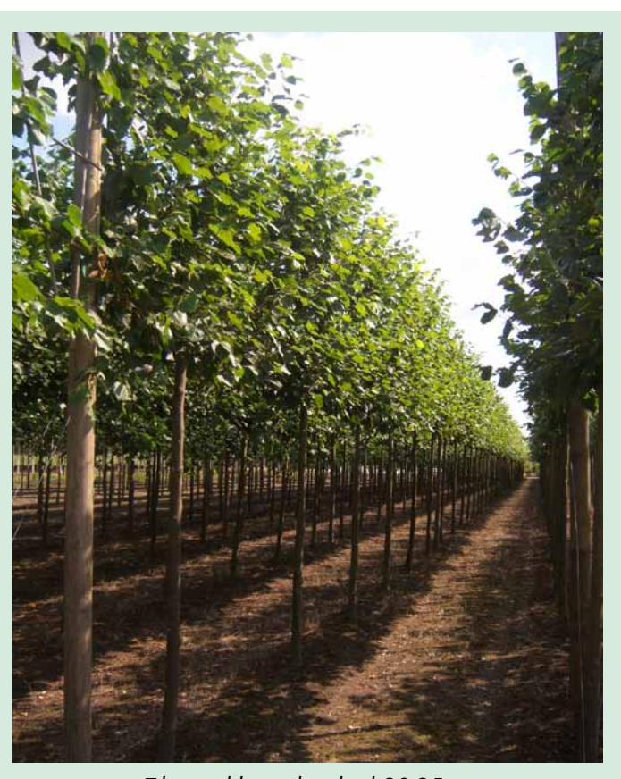
Tilia euchlora pleached 20-25cm