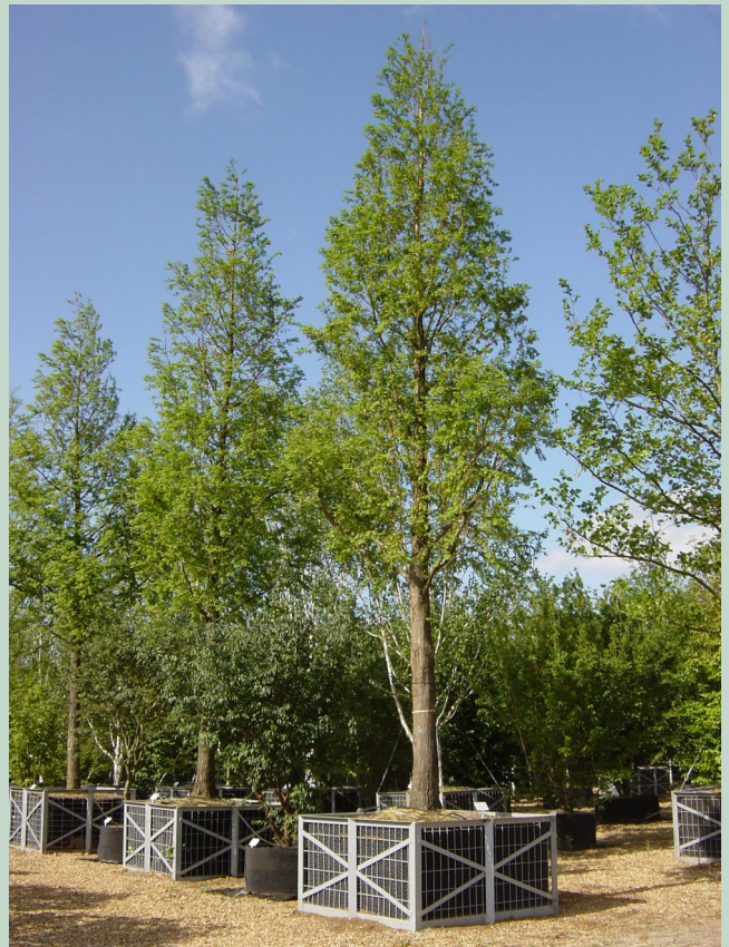
Taxodium distichum 70-80cm CG