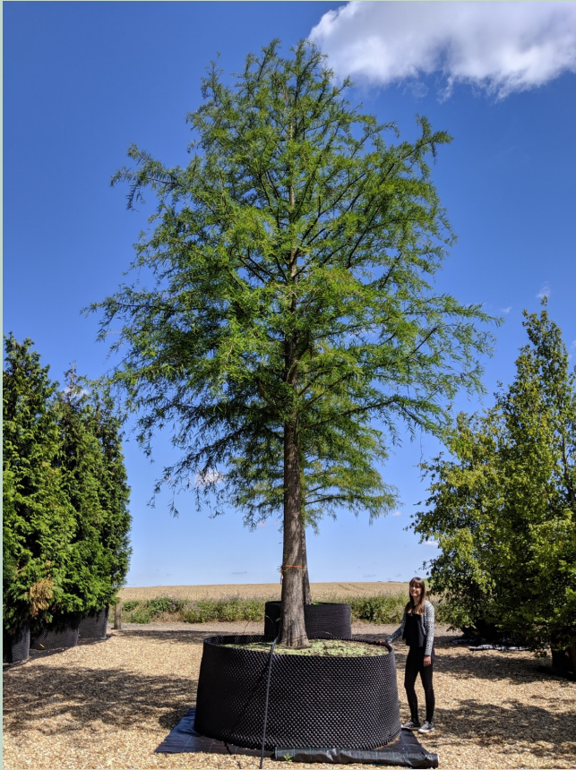
Taxodium distichum 70-80cm CG

Taxodium distichum , is a deciduous conifer that maintains a relatively narrow, pyramidal shape eventually growing to a width of between 8.0-10.0m.