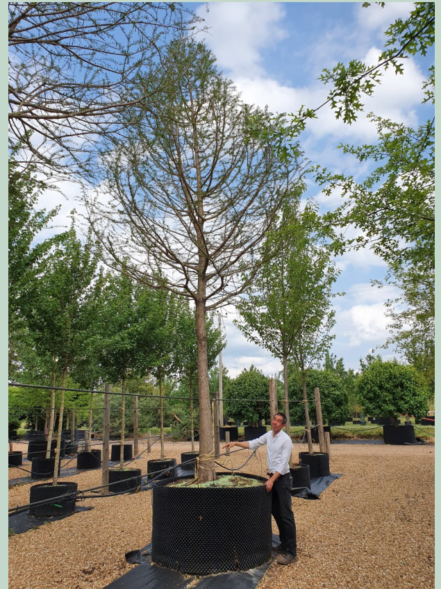
Taxodium distichum 40-45cm Std CG

The Taxodium distichum 's soft wood is rot-resistant making it particularly useful for underwater and exterior constructions.