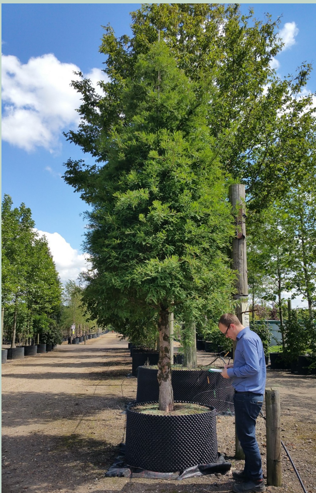
Taxodium distichum 40-45cm Half Stem CG