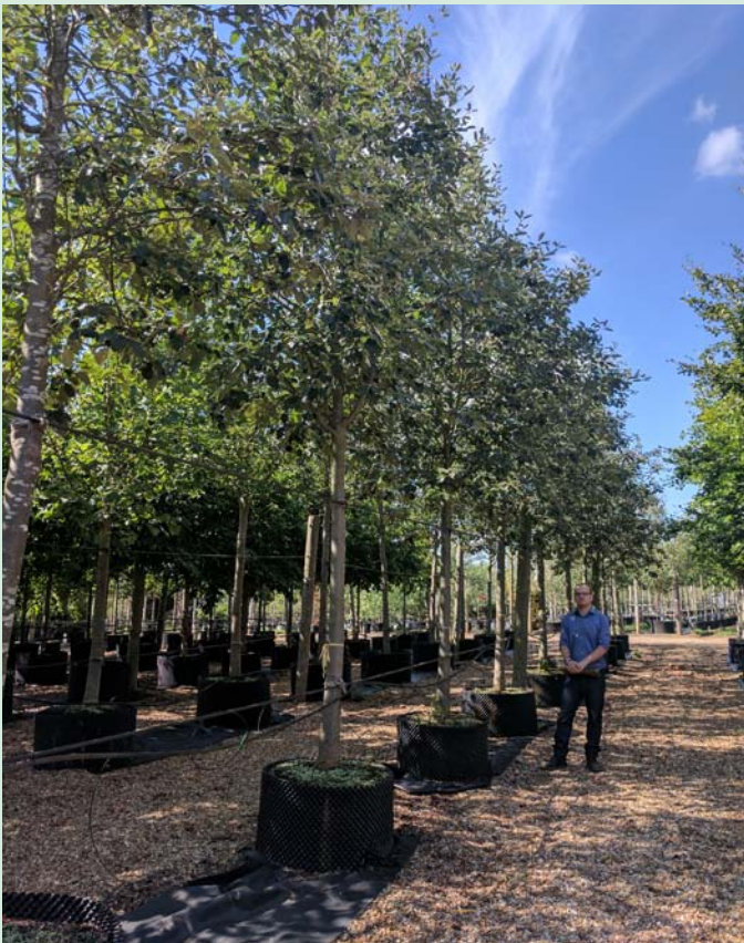
Sorbus intermedia 'Brouwers' 25-30cm girth