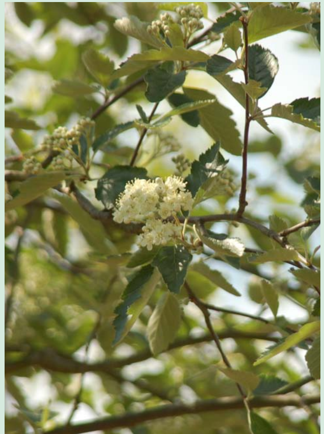
Sorbus intermedia 'Brouwers' Blossom