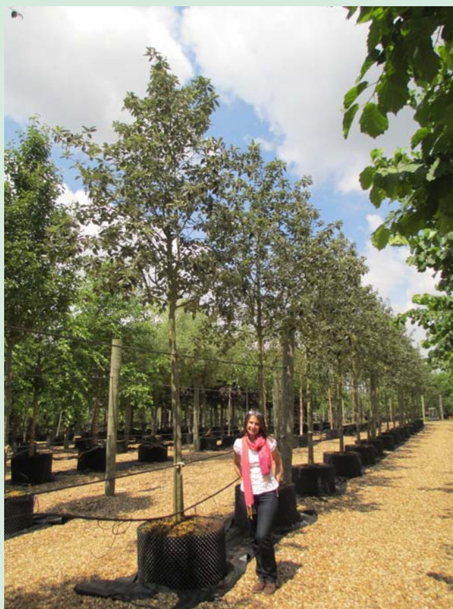
Sorbus intermedia 'Brouwers'

Sorbus intermedia 'Brouwers' or commonly known as Swedish Whitebeam has distinctive lobed leaves that are dark green in colour with grey hairs on the underside, giving a silver-grey appearance.