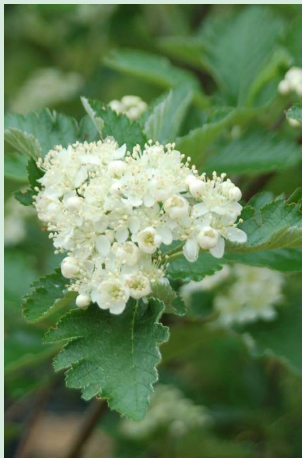
Sorbus intermedia 'Brouwers' Blossom

Beautifully creamy white flowers give off a lovely scent in May, which provides nectar which is followed by orange and red fruits in small umbels, which remain until October. These berries contrast with the firmer orange tones of the leaves of autumn.