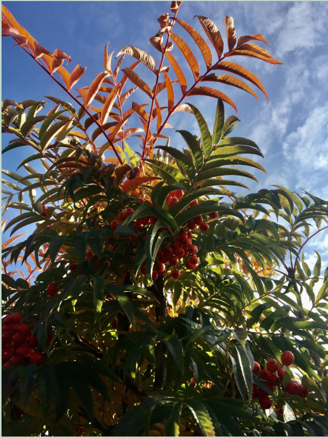
Sorbus commixta Dodong leaves and berries

Sorbus commixta Dodong , also known as Sorbus commixta Olympic Flame is native of South Korea and Japan. It was initially brought to the UK during the 1880s and has become a popular cultivar ever since.