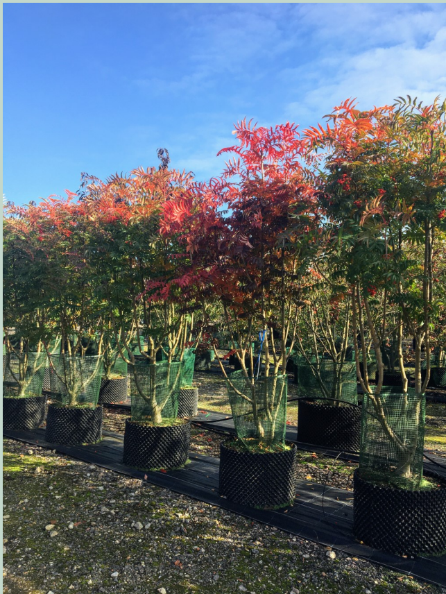
Sorbus commixta Dodong 2.5-3.0m CG