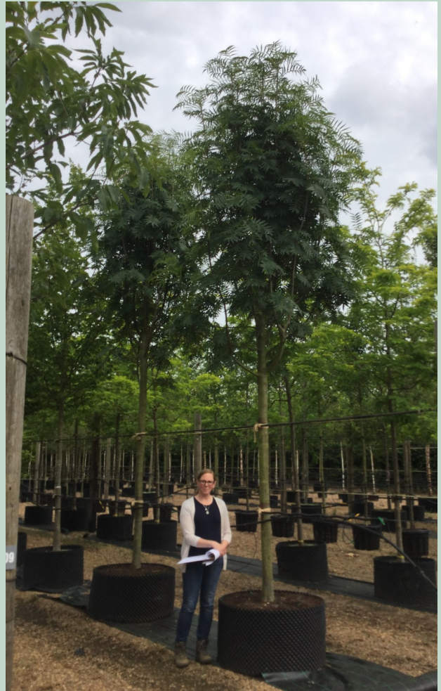
Sorbus commixta Dodong 25-30cm CG

Sorbus commixta Dodong, is pest and disease resistant.