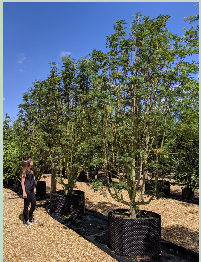
Sorbus commixta Dodong 3.5-4.0m CG

Flowers: White flowers followed by bright red berries.