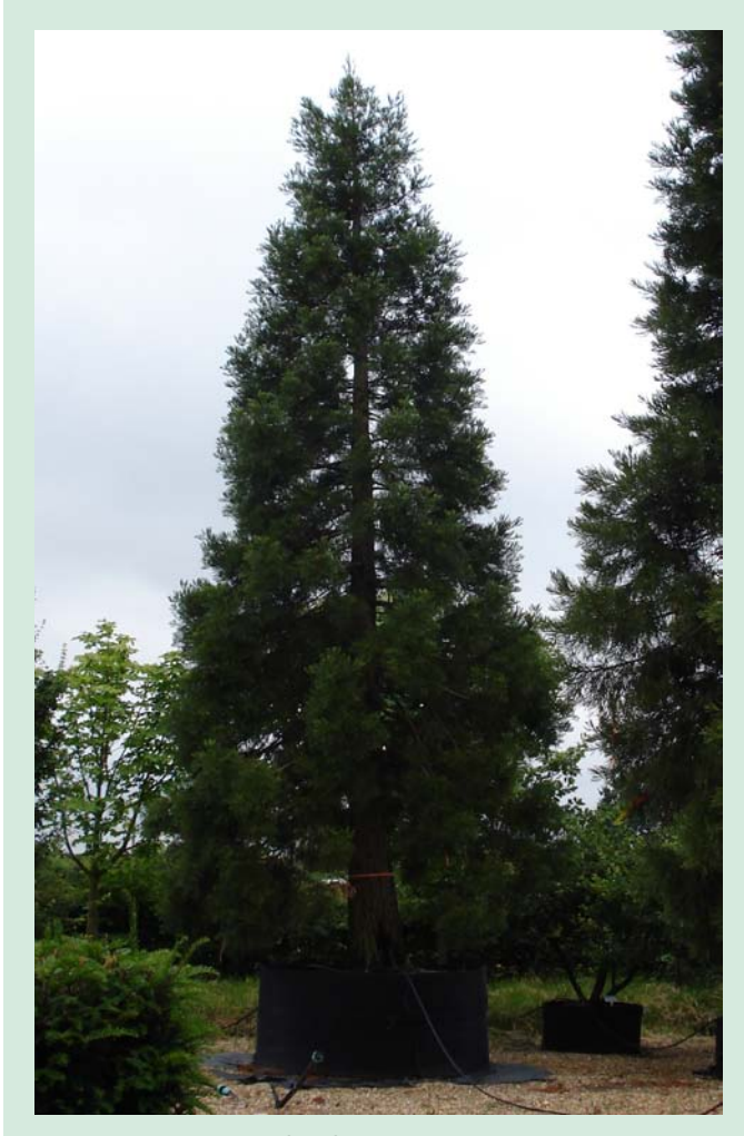
Sequoidendron giganteum CG

The cones take at least two years to ripen when they turn reddish brown but many will remain green and unopened for anything up to 20 years.