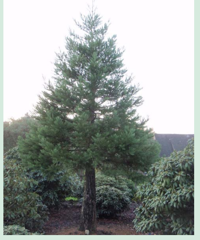
Sequoiadendron giganteum 7m