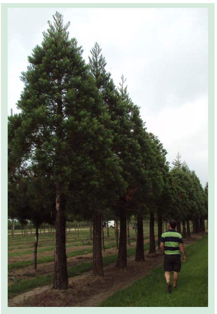
80/90 Sequoiadendron giganteum field grown