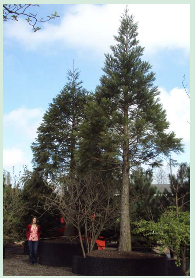
80-90 Sequoiadendron giganteum