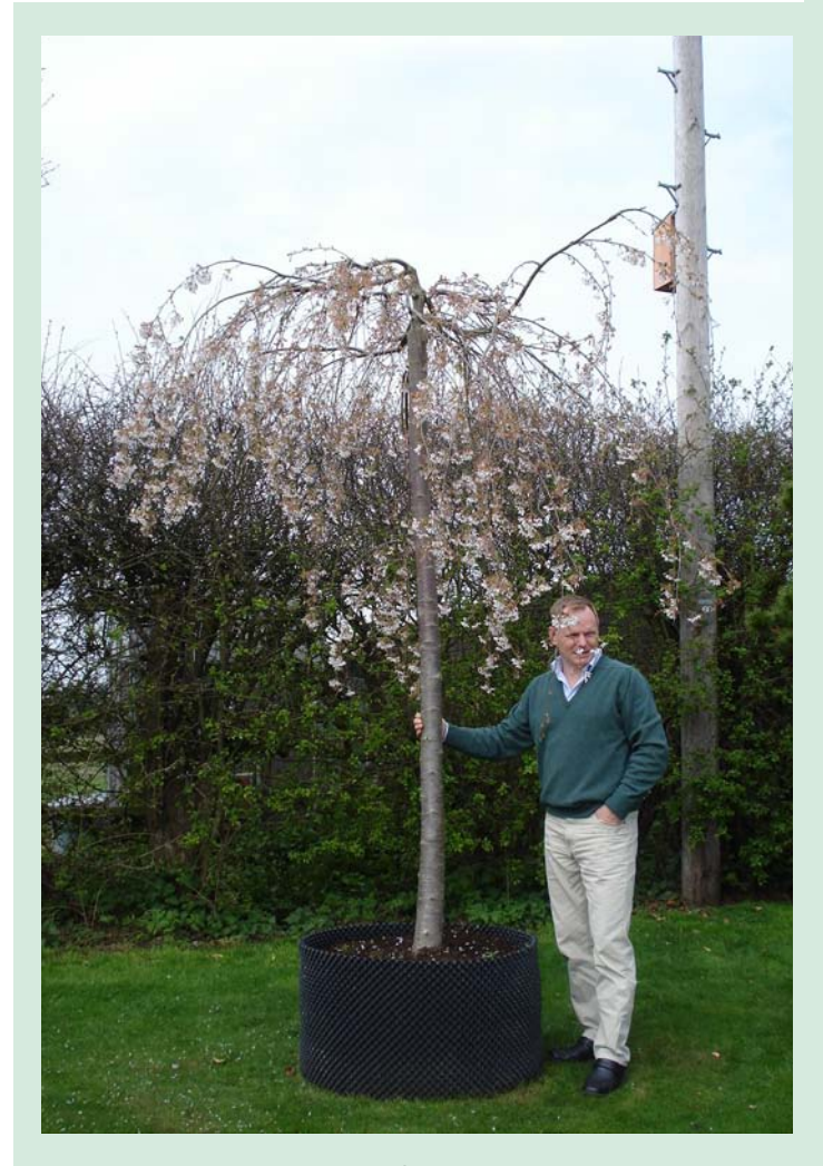
Prunus yedoensis Ivensii