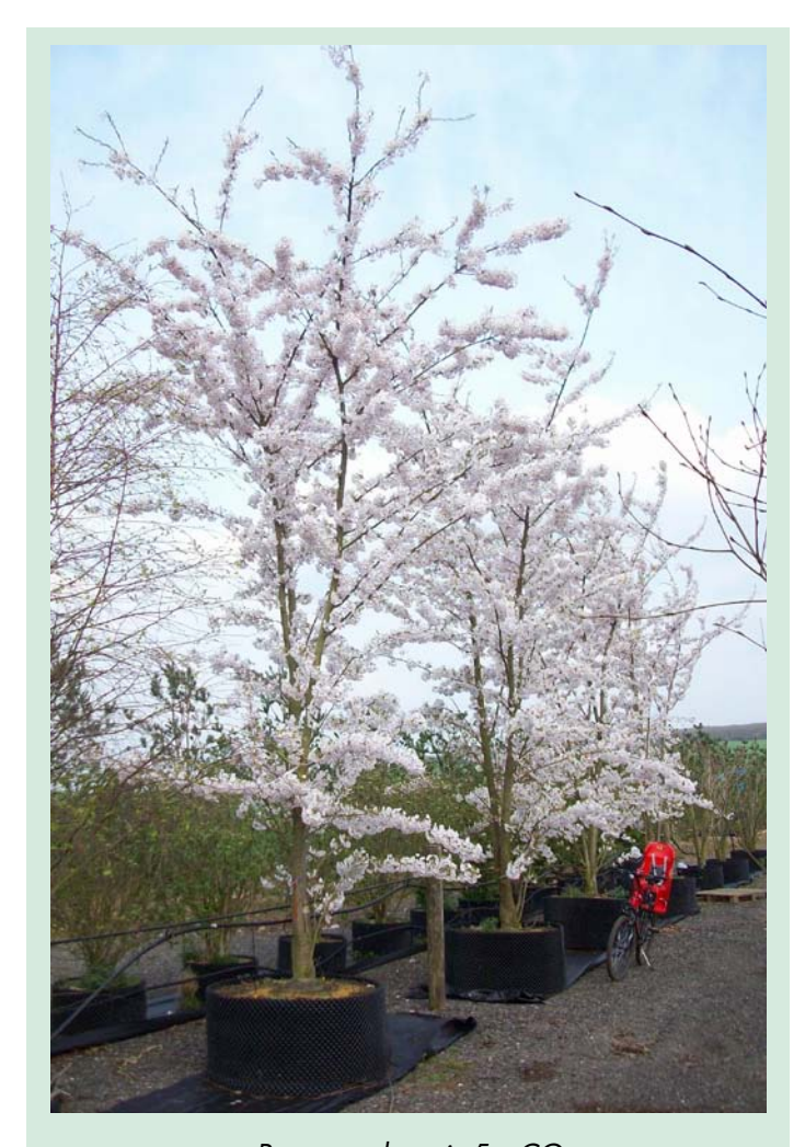
Prunus yedoensis 5m CG

They are serrated on the margins and deep green in colour turning to red-orange in Autumn.