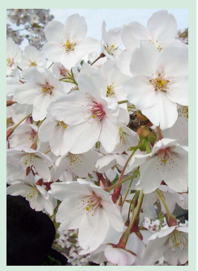
Flower of Prunus yedoensis