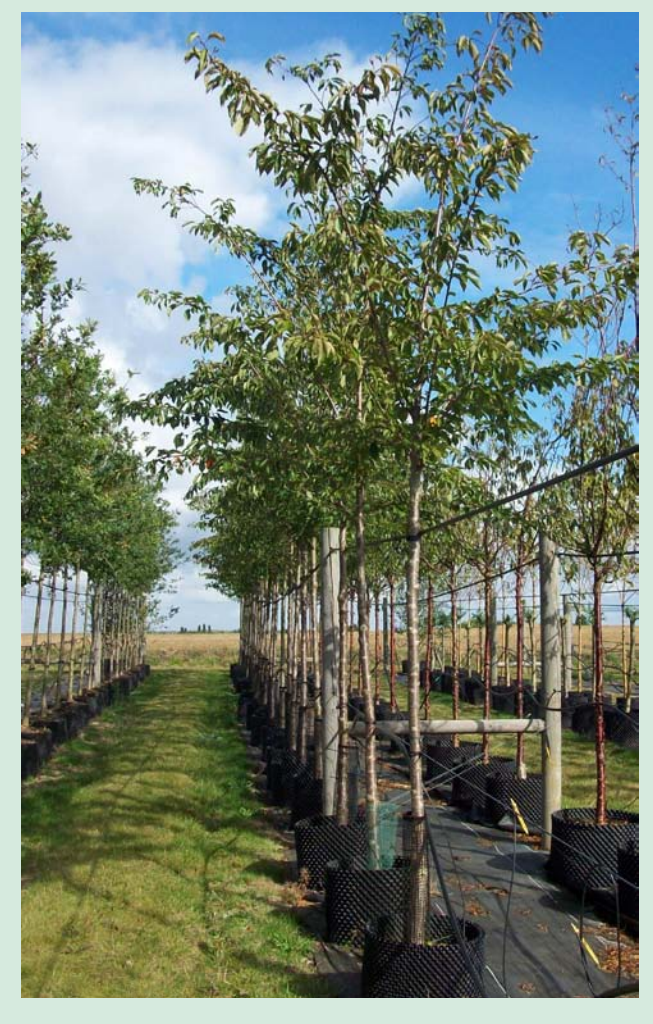
14-16cm Prunus yedoensis CG Standard