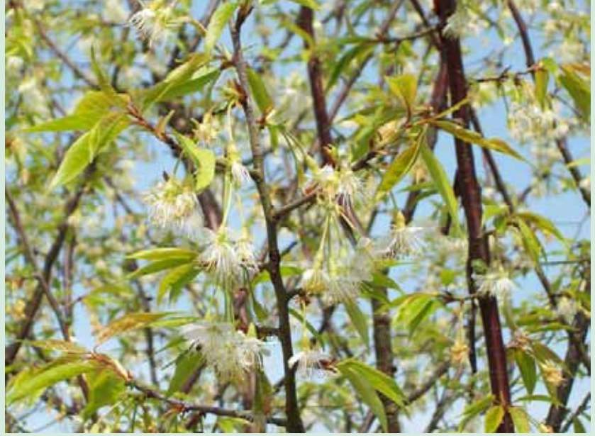
Flowers and new foliage in the spring