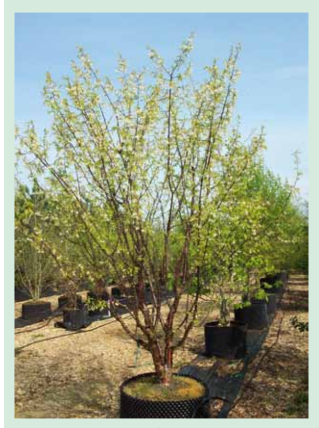
Multistem plant in spring

Flowers: Small, white flowers around April time