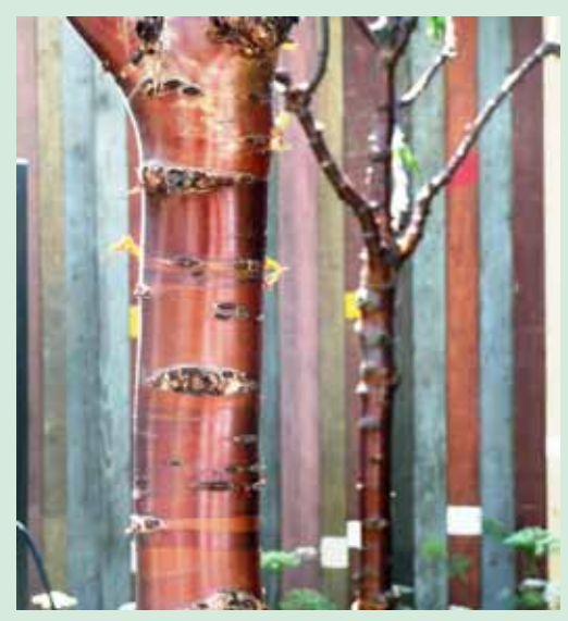
Prunus serrula at RHS Chelsea Flower Show