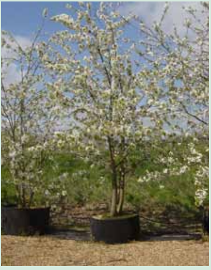
Multi-stemmed plant in Spring