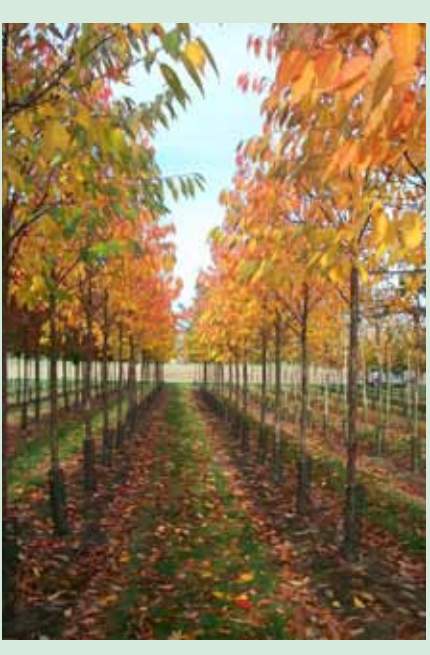
Autumn foliage of Prunus avium Plena Spring flower on 20-25cm standards