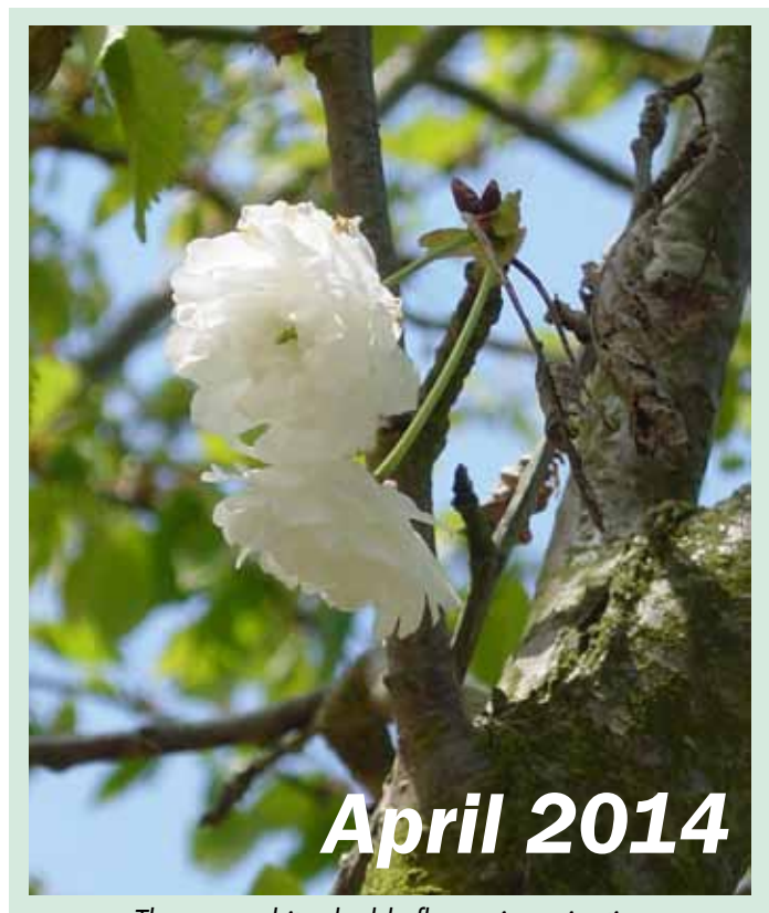
The pure white double flower in springtime

Prunus avium Plena is the spectacular double flowered variety of our native wild cherry which has been in cultivation for over 200 years.