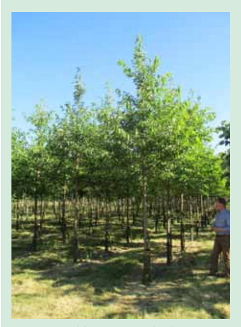
Field grown standards