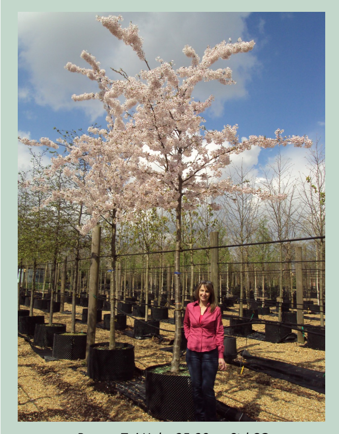
Prunus Tai Haku 25-30cm Std CG

The tree has a wide spreading canopy, usually wider than it is tall, making it a fantastic tree for larger gardens and public open spaces.