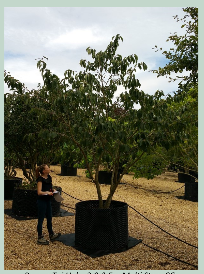
Prunus Tai Haku 3.0-3.5m Multi Stem CG