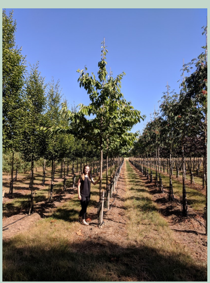
Prunus Tai Haku 20-25cm WRB