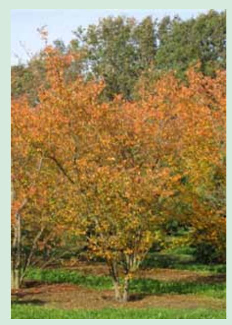
Autumn foliage of Prunus Accolade