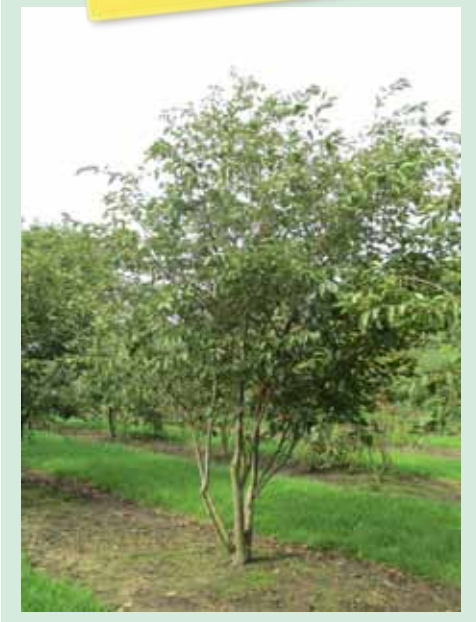
2.5-3.0m multistems, field grown