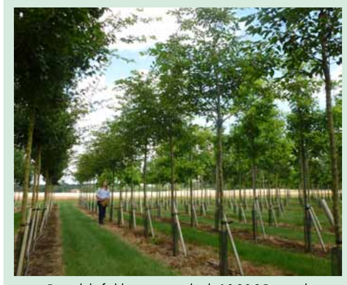
Deepdale field grown standards 18-20-25cm girth