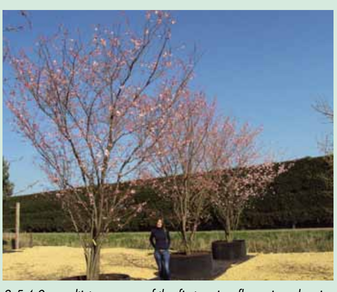
3.5-4.0m multistems, one of the first spring flowering cherries