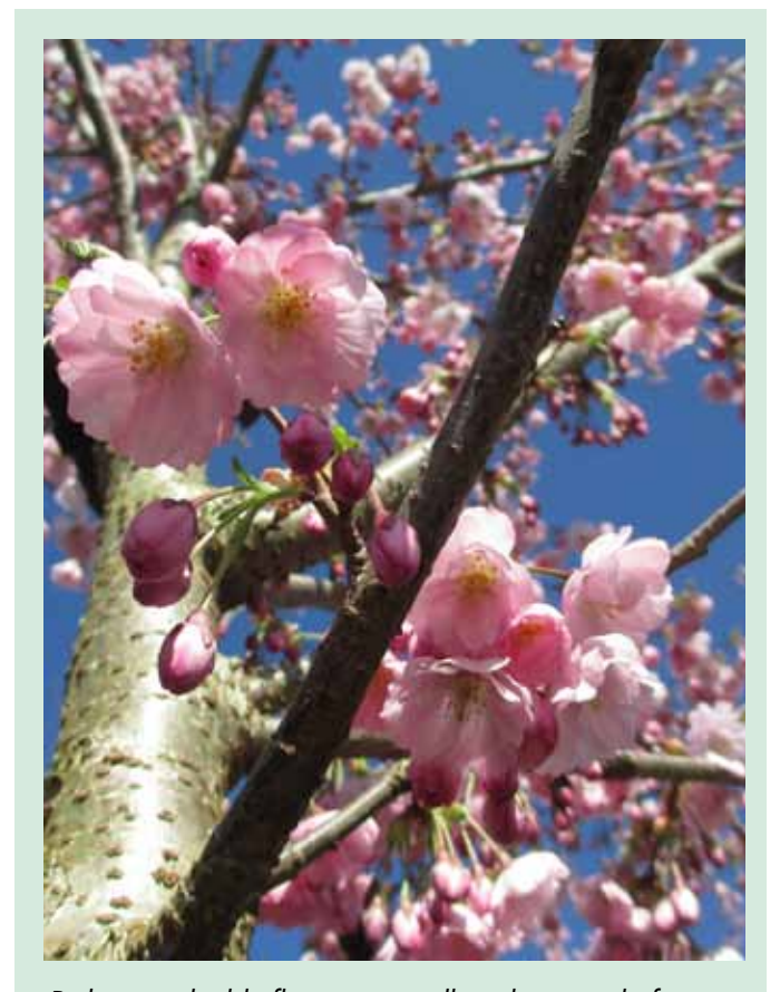
Pink, semi-double flowers, signalling the arrival of spring

Bark: Smooth red-brown, with vertical lenticels