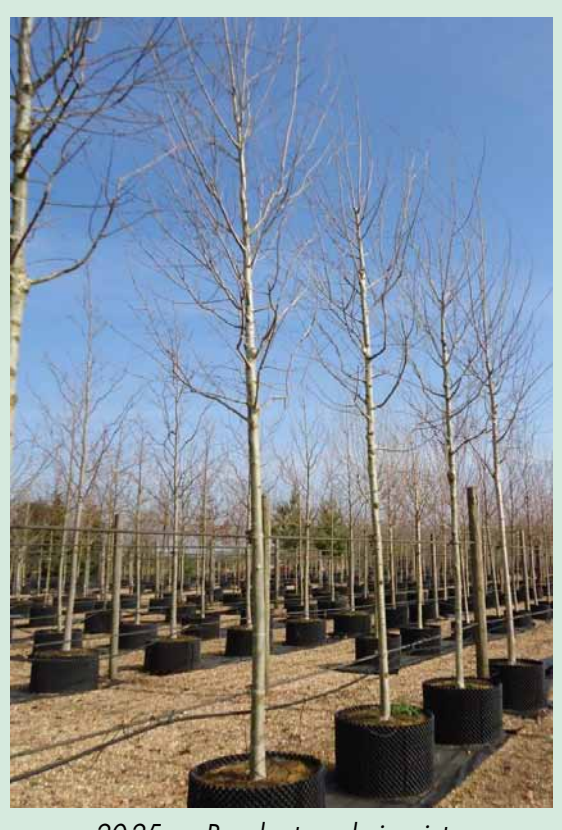
20-25cm Populus tremula in winter