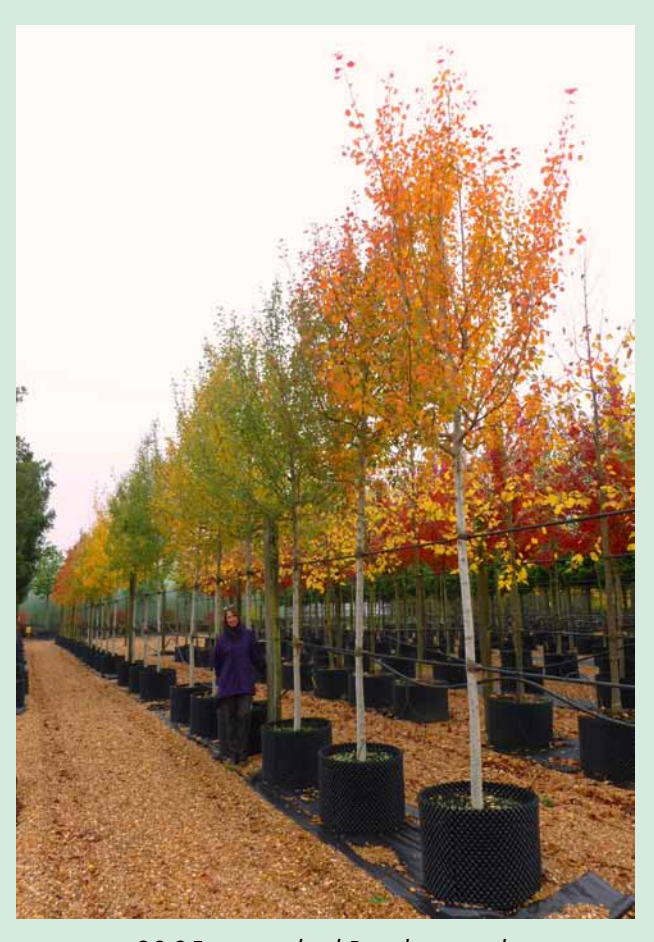
20-25cm standard Populus tremula