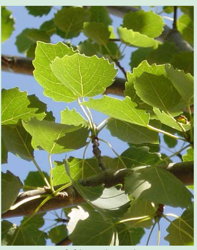
Leaf of the Populus tremula

The name tremula means to the way tremble and refers to the way the leaves glutter and move in the slightest breeze. According to legend the cross of Christ was made of Aspen wood.