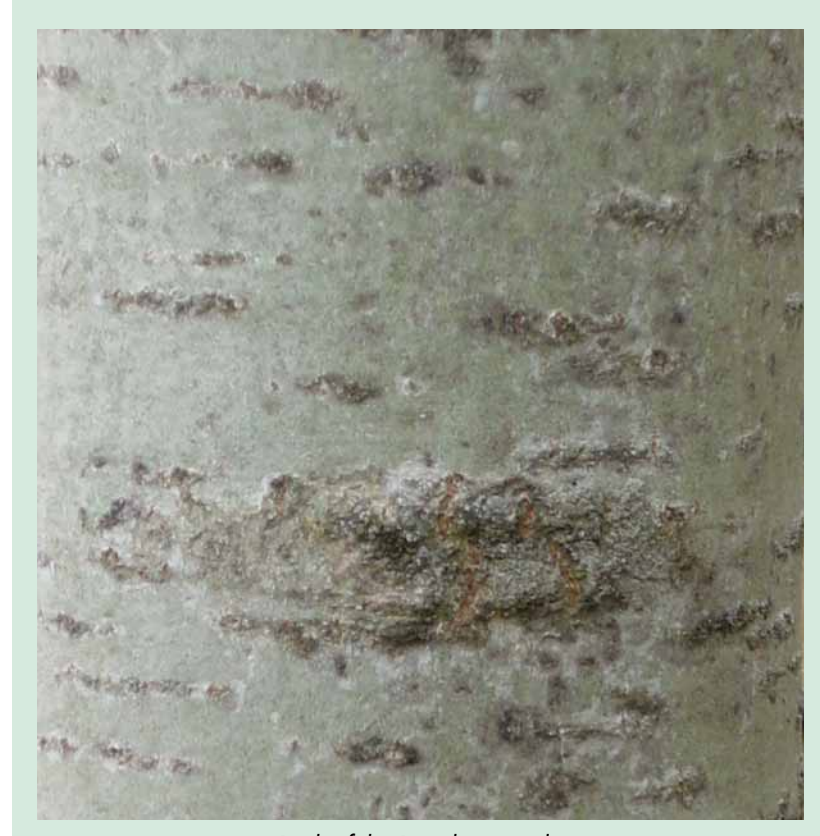
Bark of the Populus tremula