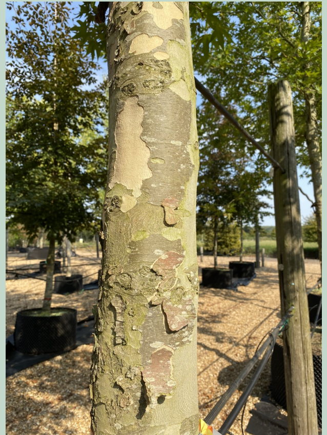
Platanus orientalis Minaret peeling bark

The fresh leaves of the Platanus orientalis Minaret can be used as a treatment of Ophthalmia