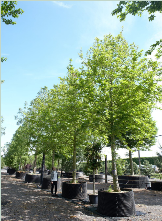
Platanus orientalis Minaret 45-50m CG