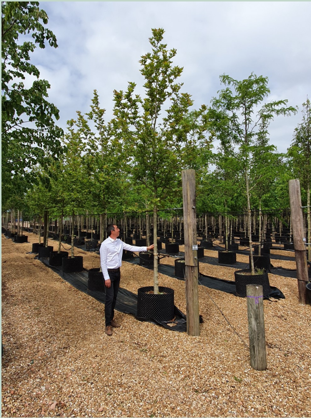
Platanus orientalis Minaret 18-20cm CG

Platanus orientalis is a deciduous tree with widely spreading branches and highly dissected leaves, native to southeast Europe and southwest Asia.