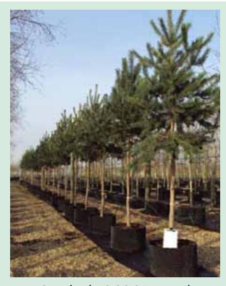
Standard 18-20-25cm girth