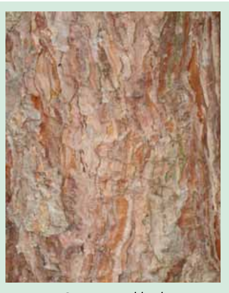
Orange - red bark