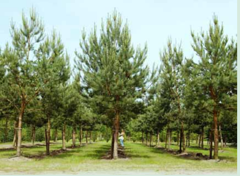
Field grown Pinus sylvestris