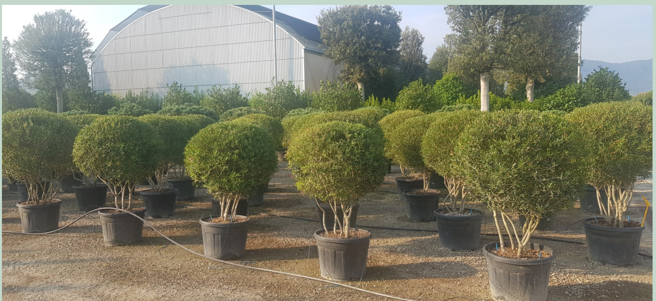
Phillyrea angustifolia 1.25-1.5m Umbrella CG