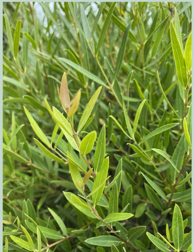
Phillyrea angustifolia leaves