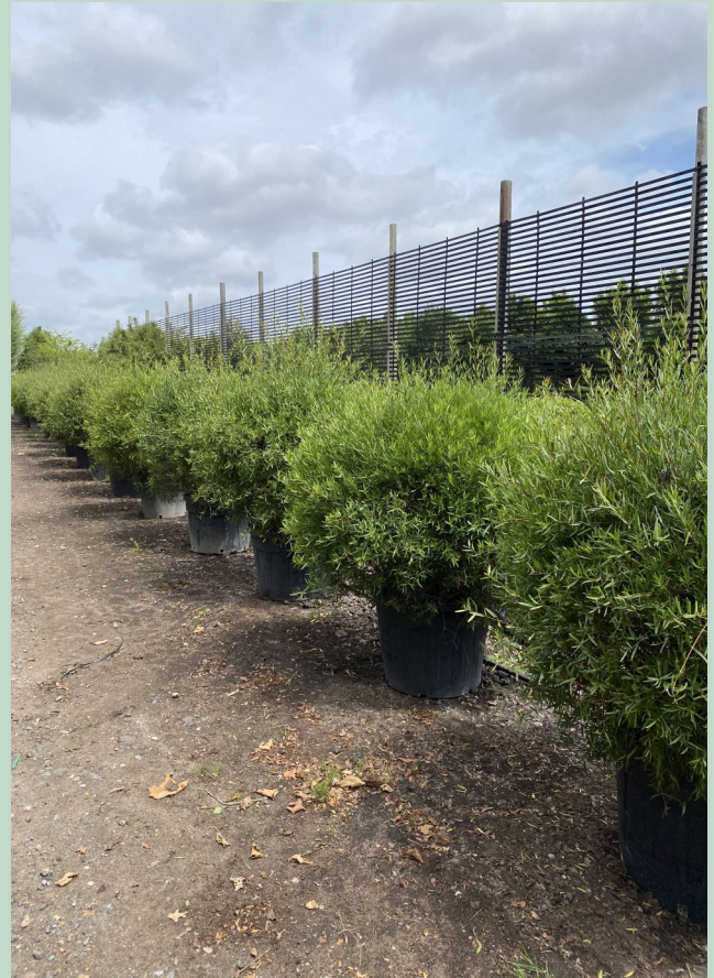
Phillyrea angustifolia 1.2m Dome CG

Phillyrea angustifolia can tolerate high levels of salinity in the soil, making it suitable for maritime locations.