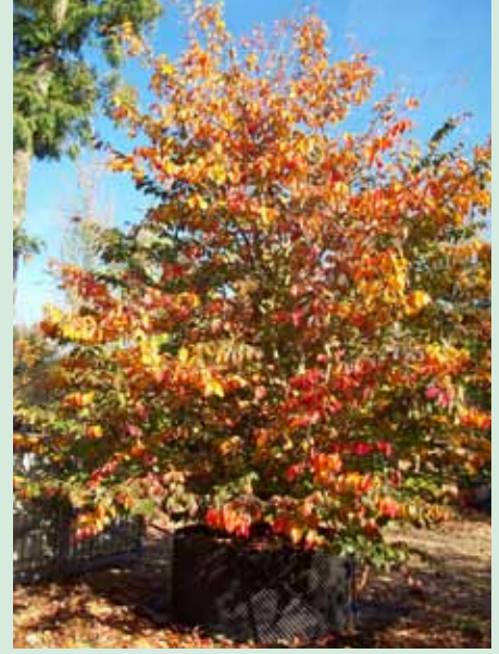
4-5m multistem with autumn foliage