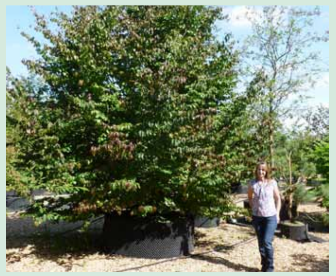
4-5m Persian Ironwood multistem in summer

Deepdale Trees Ltd., Tithe Farm, Hatley Road, Potton, Sandy, Beds. SG19 2DX. Tel: 01767 26 26 36