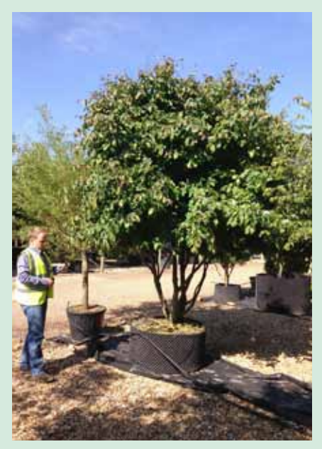
Umbrella pruned specimen H3-3.5m