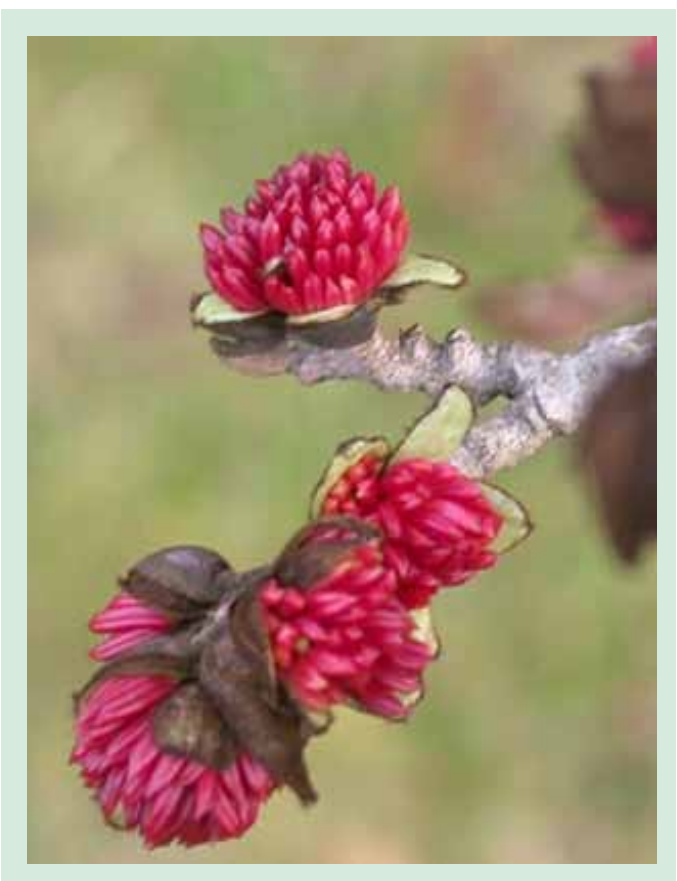
Clusters of flowers add winter interest

Bark: Fine plates flake in cream, grey and orange