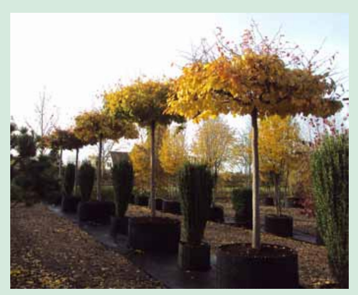
Parrotia persica roof trained specimens, 20-25cm girth