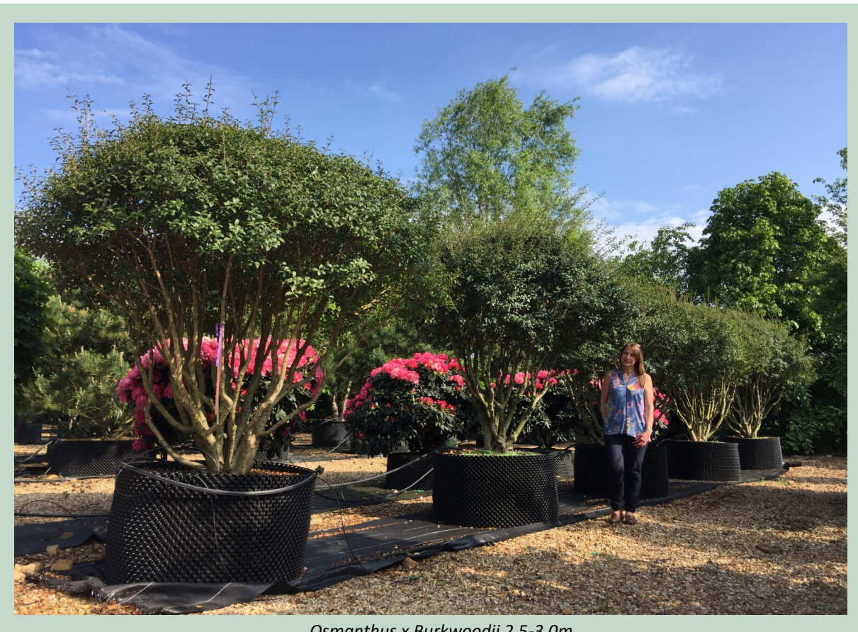
Osmanthus x Burkwoodii 2.5-3.0m