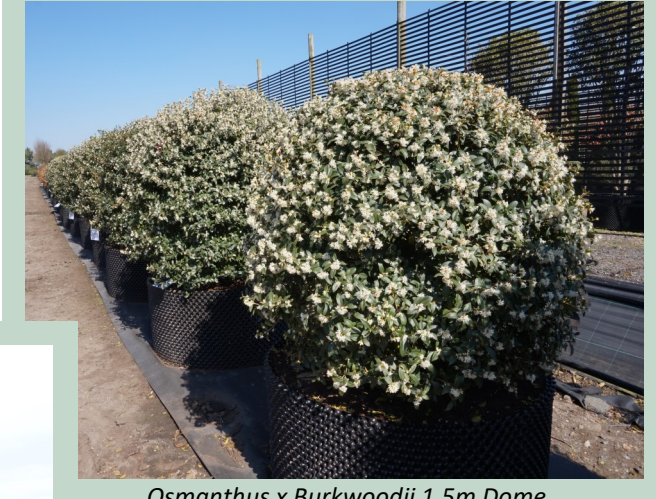
Osmanthus x Burkwoodii 1.5m Dome