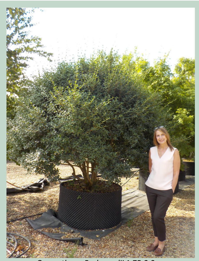
Osmanthus x Burkwoodii 1.75-2.0m

While slow growing, Osmanthus x burkwoodii is an extremely versatile plant. It is extremely hardy and can grow in a variety of soil types, even tolerating full shade. There is no need to prune, but we quite often do, in order to shape into a dense hedge, ball or even mushroom form. As a hedge or clipped shape, it is a great alternative to Box.