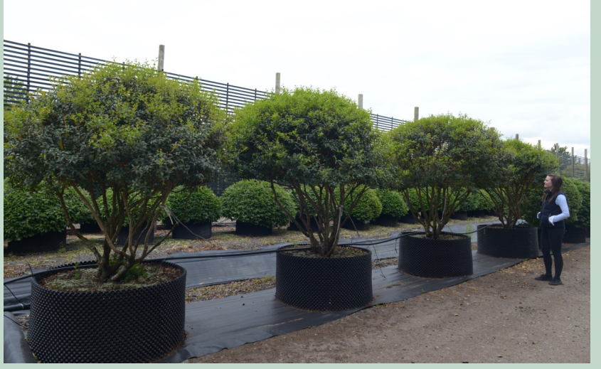
Osmanthus x Burkwoodii 2.0m Umbrella