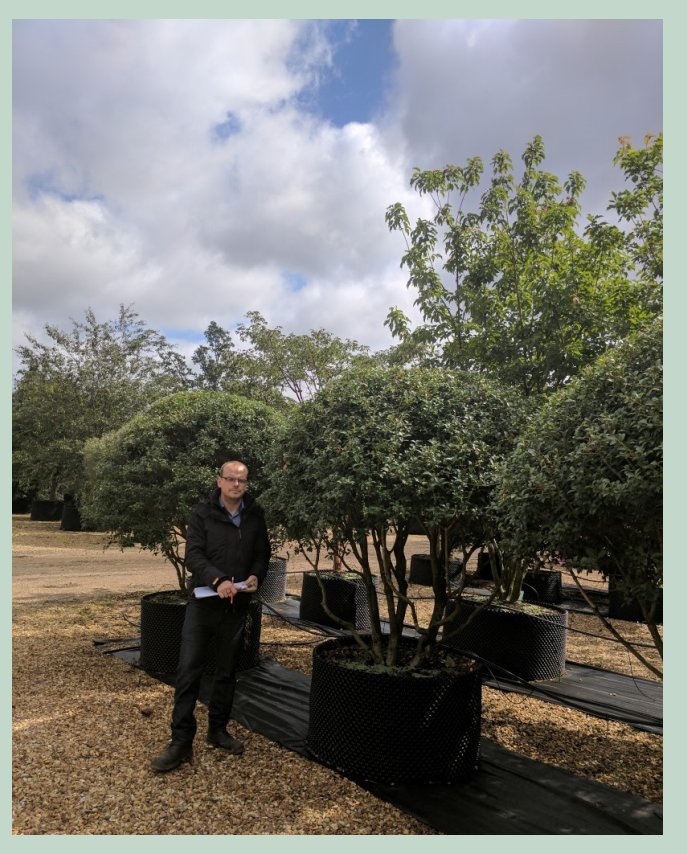
Osmanthus x Burkwoodii 2.0-2.5m CG