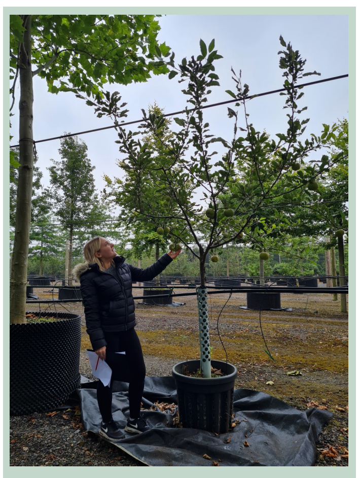
Malus domestica half stem 14-16cm

Flowers: 5 petalled, white flowers blooming between April to June.