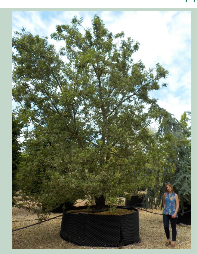
Malus domestica 6.0-7.0m