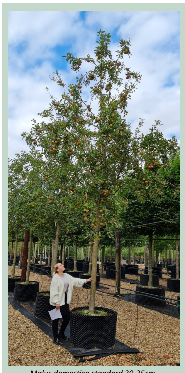
Malus domestica standard 30-35cm

Malus domestica make up half of the worlds deciduous fruit tree population.