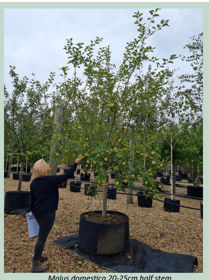
Malus domestica 20-25cm half stem