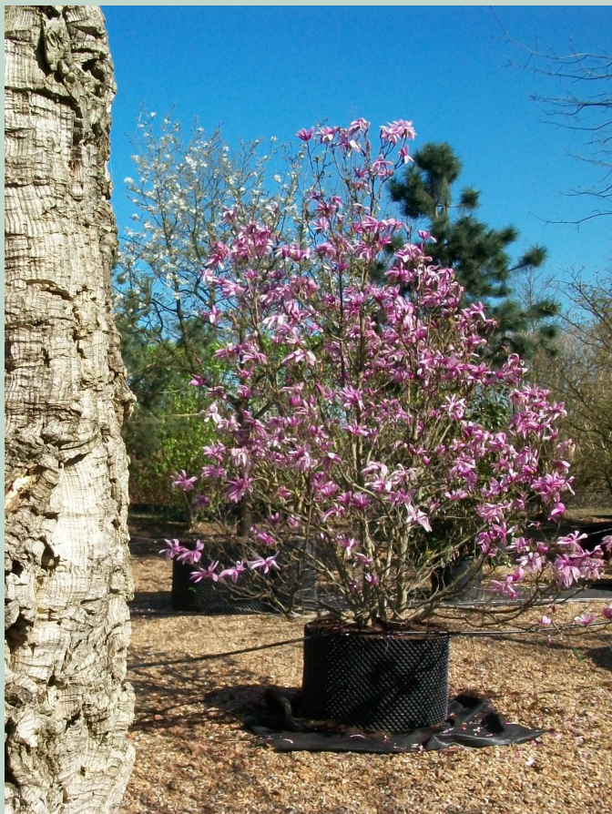
Magnolia Susan 3.0-3.5m Feathered CG