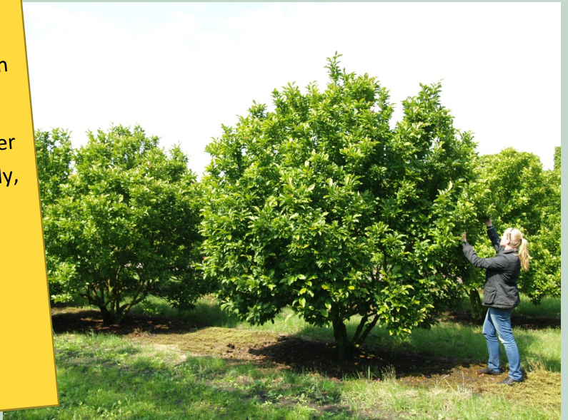
Magnolia Susan 2.5-3.0m Multi Stem CG

The names of the Magnolias in the other 'Little Girls' series are: Ann, Betty, Jane, Judy, Pinkie, Randy, Ricki.