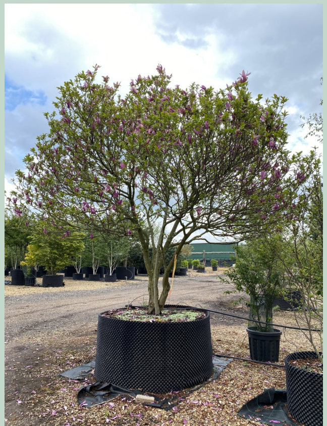
Magnolia Susan 3-3.5m Umbrella CG

Flowers: Deep pink purple tulip shaped flower