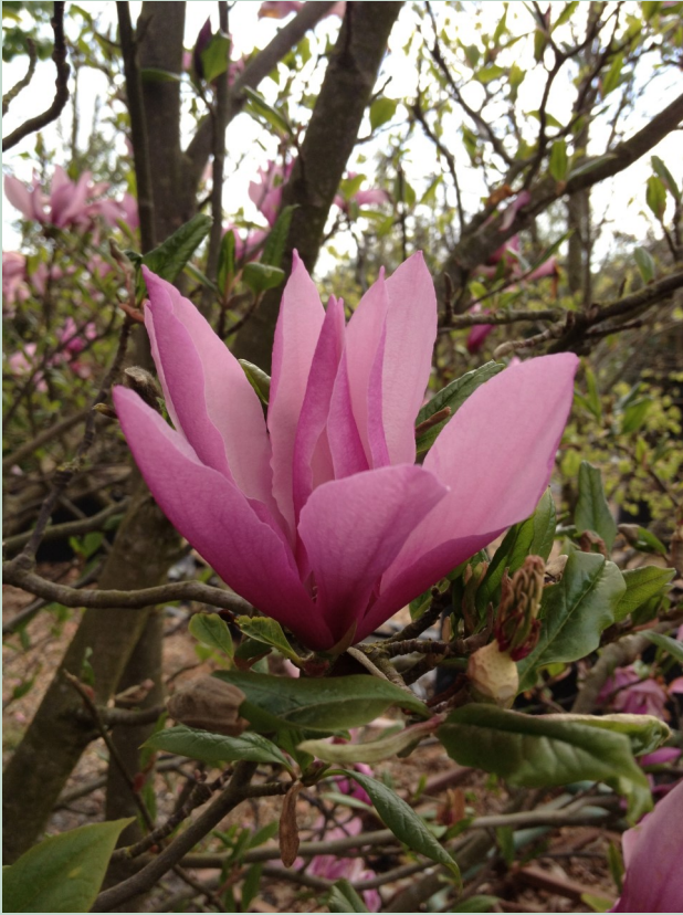
Magnolia Susan Flower

Magnolia Susan is a cross between Magnolia liliflora 'Nigra' and Magnolia stellata 'Rosea'. It belongs to the 'Little Girl' series of hybrid Magnolias developed at the U.S. National Arboretum in the mid-1950s.