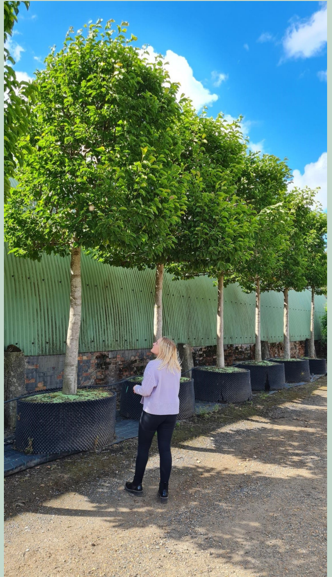
Magnolia Kobus 35-40cm pleached

The archaeologists planted the seed assuming it would not grow however they were wrong. It did grow but unlike other magnolia trees, it had 7 petals rather than 6.