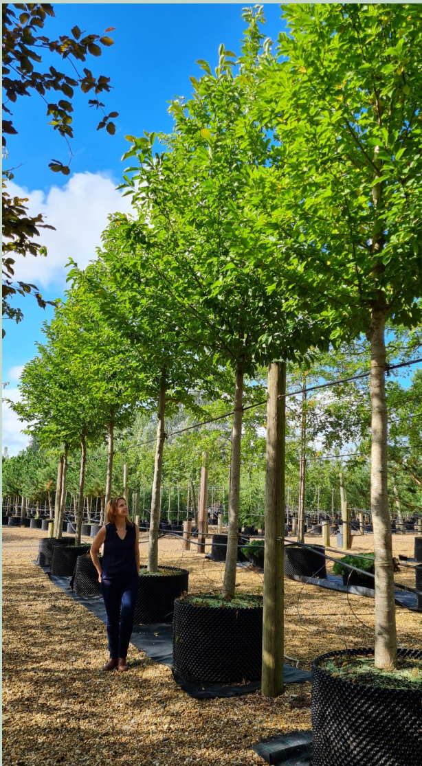
Magnolia kobus 25-30cm standard