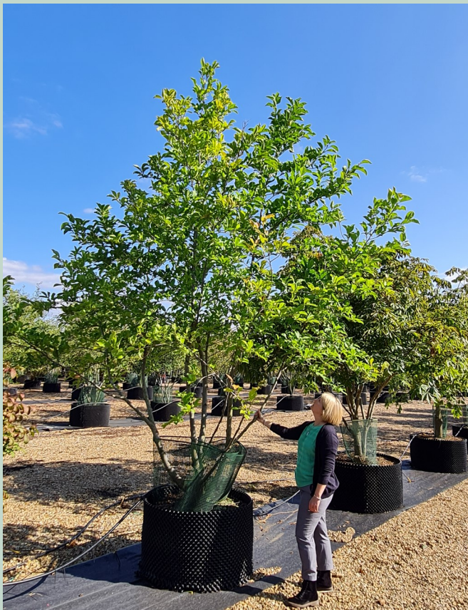
Magnolia kobus umbrella 3.0-3.5m

Magnolia kobus is an ancient, deciduous plant native to Japan. It can reach heights of over 12 metres in a time span of 20-50 years.