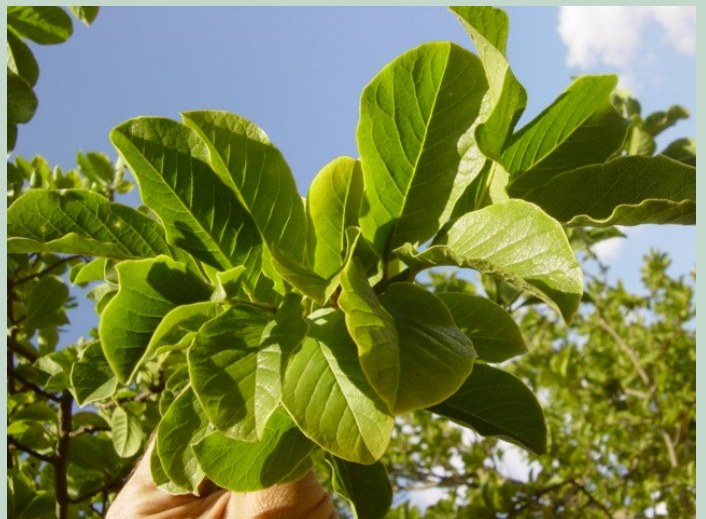
Magnolia kobus leaf