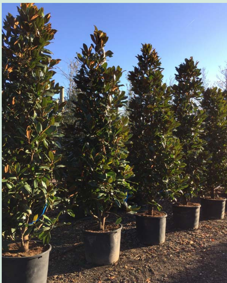
Magnolia grandiflora feathered 3/3.5m