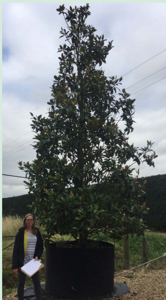
Large feathered Magnolia grandiflora 5/6m