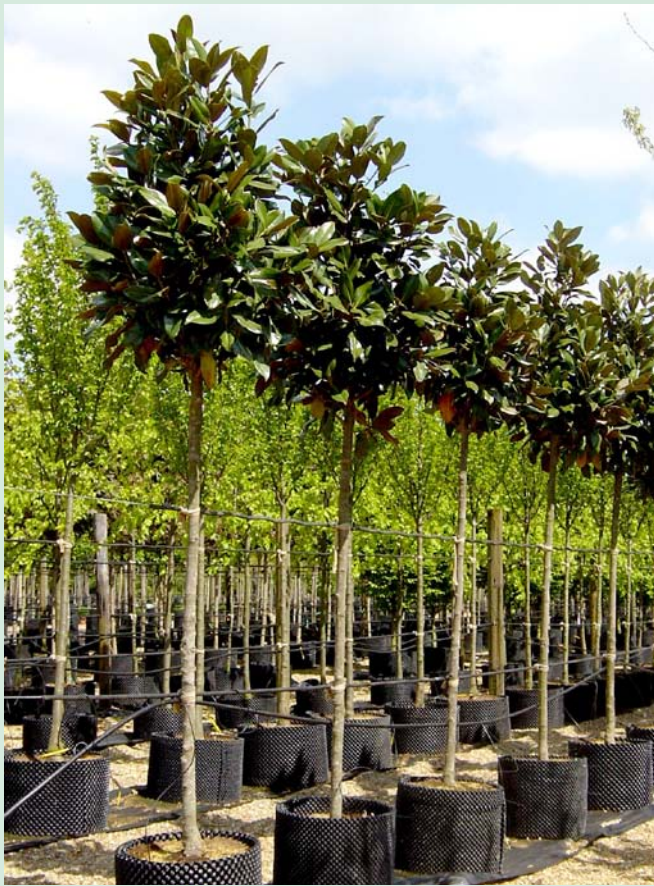
Magnolia grandiflora 18-20cm

Native to the southern United States of America Magnolia grandiflora is a large, rounded evergreen shrub or tree with dense, glossy dark green, leathery oblong-elliptic leaves, often rusty brown beneath.