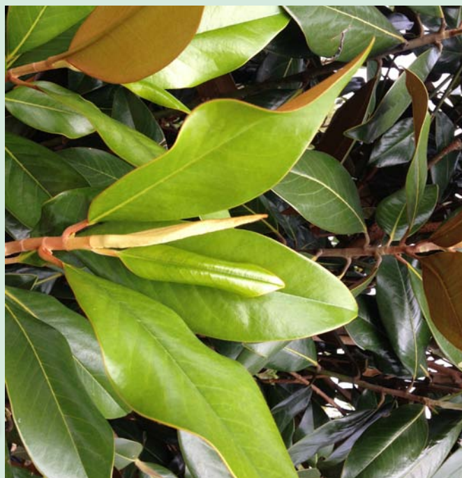
Foliage of Magnolia grandiflora

Its common name derives from the leaves being like those of the red bay and its large size. The timber of the Magnolia grandiflora is hard and heavy and has been used commercially to make furniture, pallets and veneer.