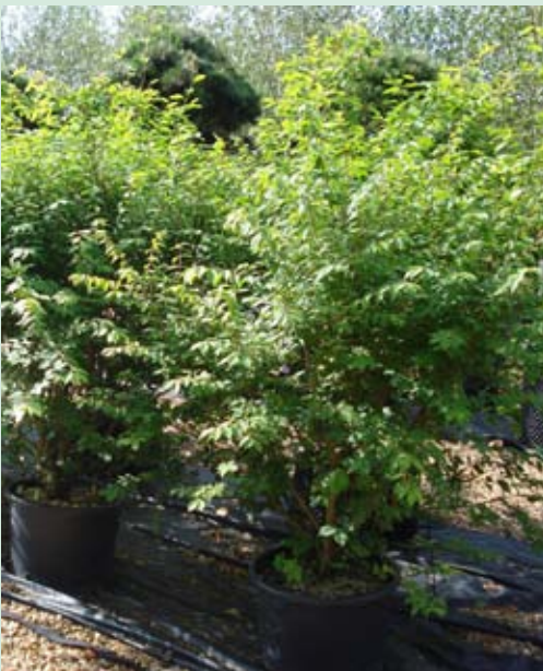
1.0 - 1.5m multistem