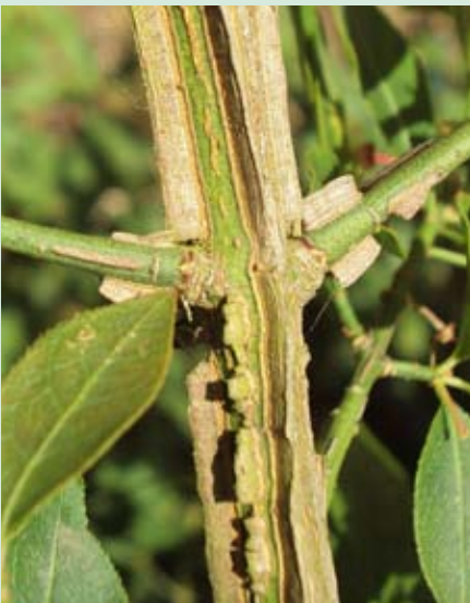
Unusual winged stems