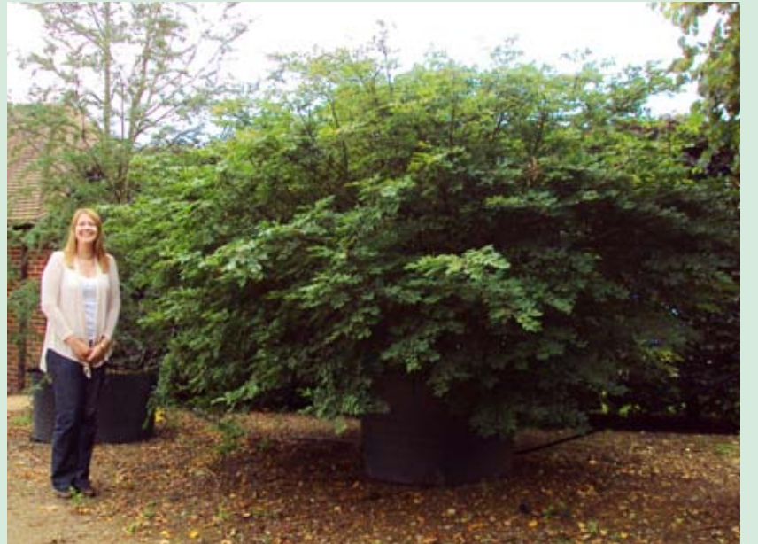
2.5 - 3.0m multistem