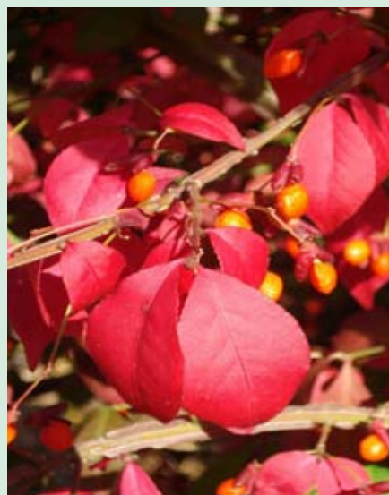
Autumn colour and berries