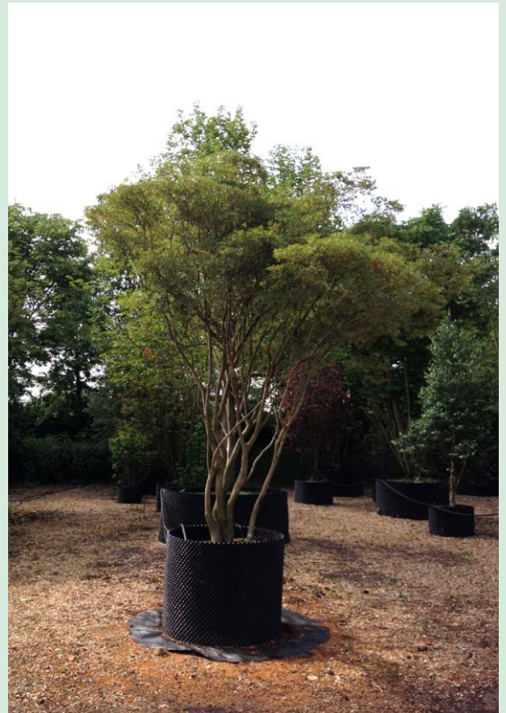
Umbrella Enkianthus campanulatus