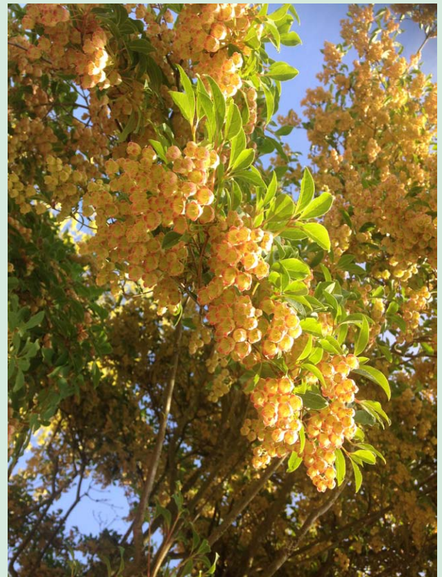
Flowers of the Enkianthus campanulatus