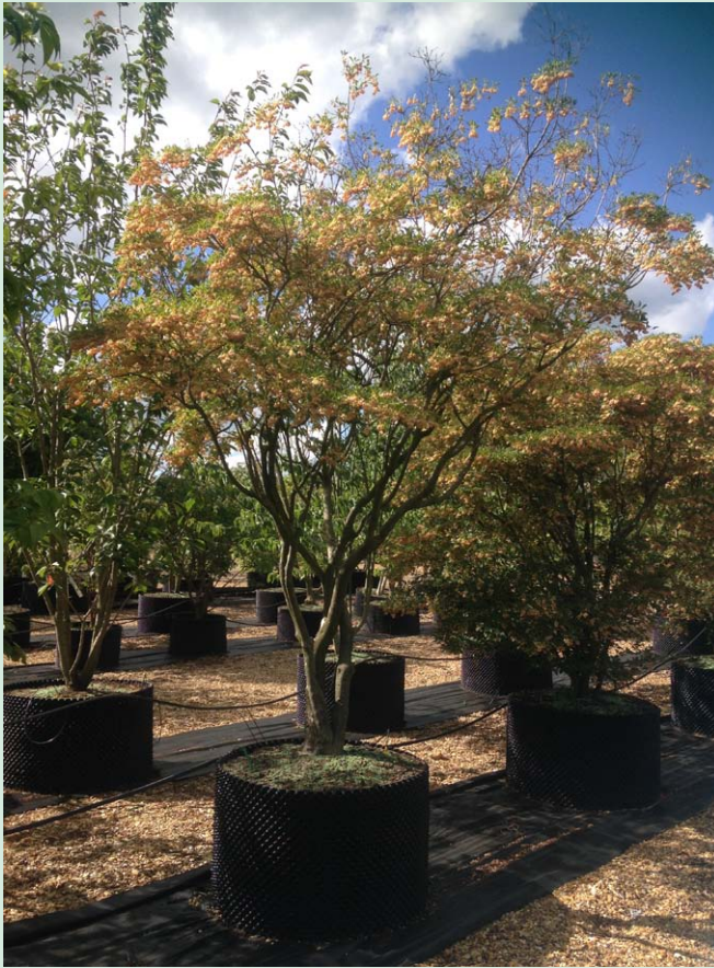
2.5-3m Enkianthus campanulatus

A spreading deciduous shrub Enkianthus campanulatus which originates from countries in North East Asia has two notable seasons.