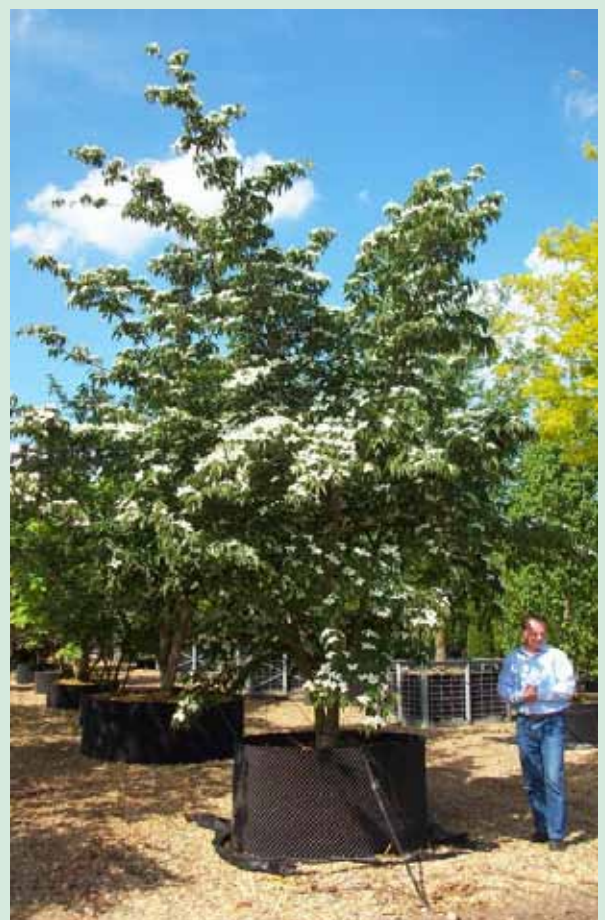
Cornus kousa 4.0-4.5m

Autumn Colour: Foliage colours reds and purples