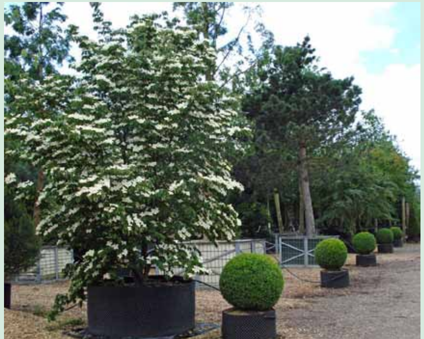
Cornus kousa Chinensis 4.0-5.0m