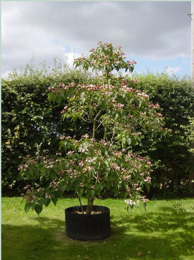
Clerodendron trichotomum M/S CG

Clerodendron trichotomum is a deciduous large shrub / small tree originating from West China, it was first introduced to the UK in the 1880s and has been a hit ever since. The shrub offers interest all year-round, with both its flowers and berries.