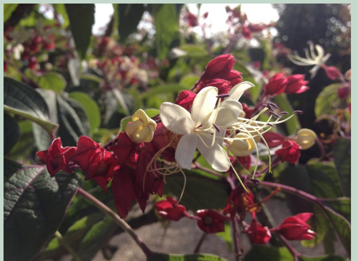
Clerodendron trichotomum Flower