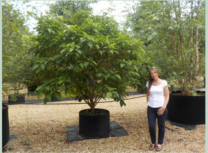
Clerodendron trichotomum 2.0-2.5m M/S CG

This highly interesting tree won the Royal Horticultural Society's First Class Certificate in 1893.