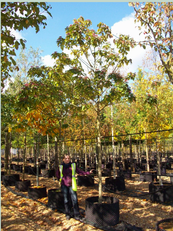
Clerodendron trichotomum STD CG