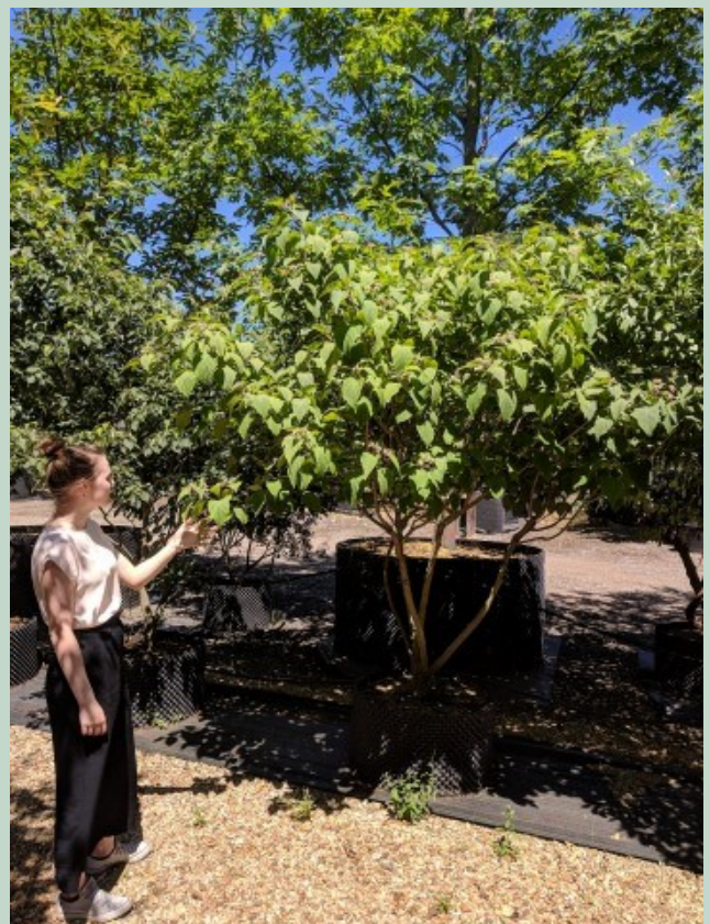
Clerodendron trichotomum 2.0-2.5m M/S CG