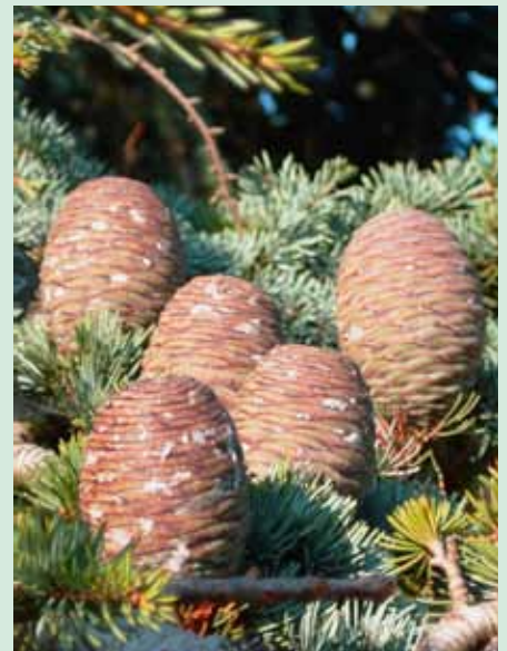
Barrel shaped cones