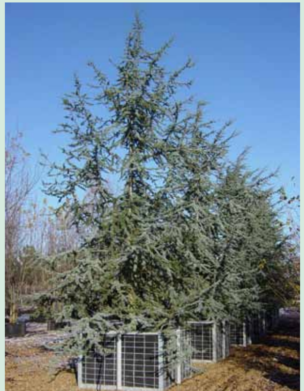
Cedrus atlantica Glauca 7.0-8.0m specimens

Fruit: Barrel shaped cones can take up to two years to mature