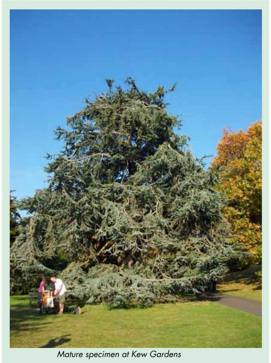
Mature specimen at Kew Gardens