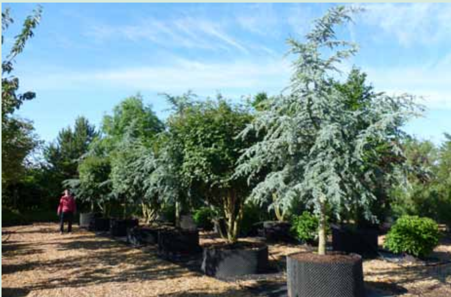
Blue Atlas Cedar half stems