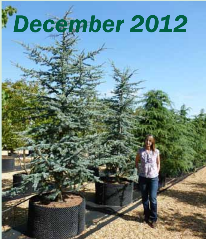
Blue Atlas Cedar 2.5-3.0m feathered plants

Cedrus atlantica are native to the Atlas mountains of Algeria and Morocco. The 'Glauca Group' are one of the most striking in appearance of all the blue conifers.