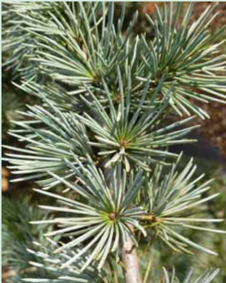
Short blue needles