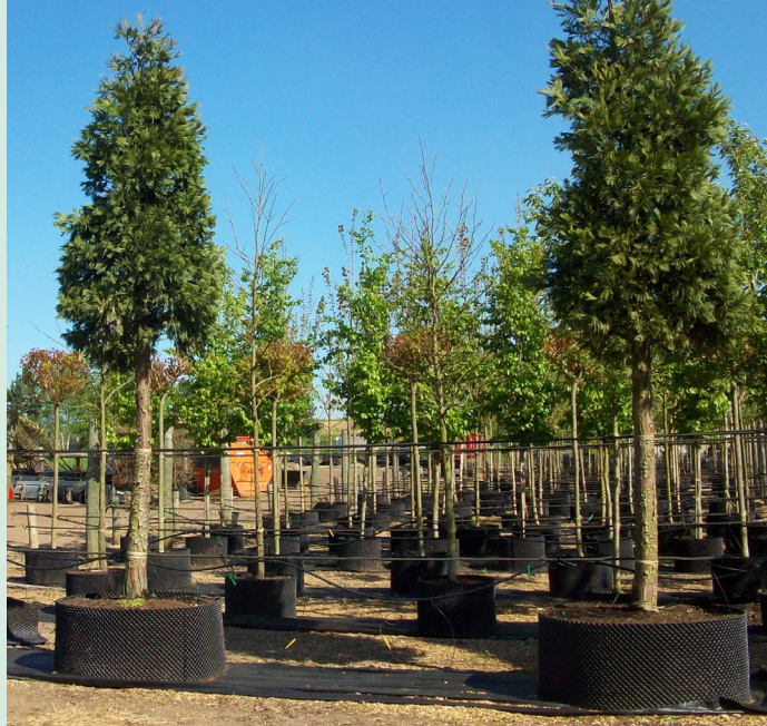
Calocedrus decurrens 40-50cm girth standards

At this time of year there are a few trees which really stand out on the nursery and one of these is Calocedrus decurrens .