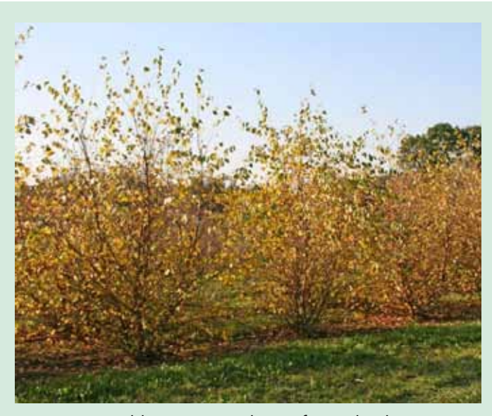
Golden autumn colours of River birch