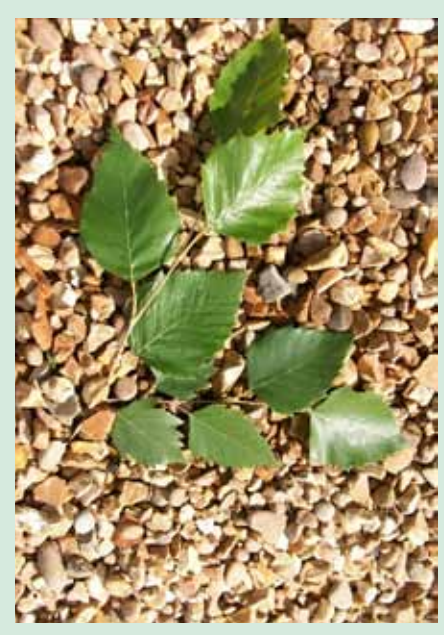
Foliage of River birch