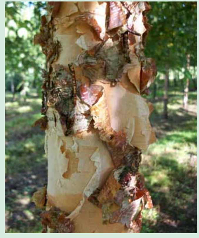
Beautiful, peeling bark provides year round interest

Betula nigra is a large, deciduous tree with the potential for growing to 25m tall with a wide, ovoid crown and gracefully arching branches.