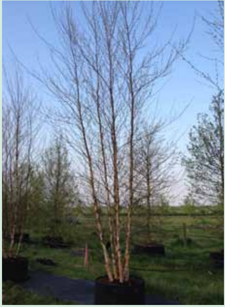
Attractive bark provides winter interest