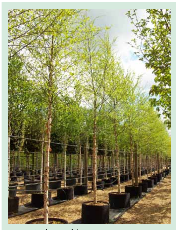
Bright green foliage emerging in spring

Bark: The most appealing feature, cinnamon coloured peeling in curly strips to reveal oranges and creams underneath.