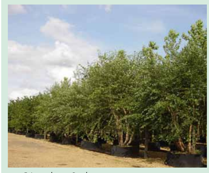
5-6m multistem Betula nigra grown in airpot container