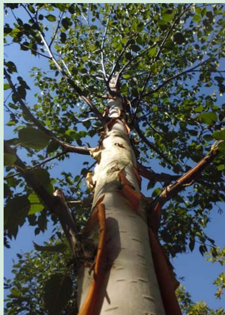
Chinese Red Birch bark