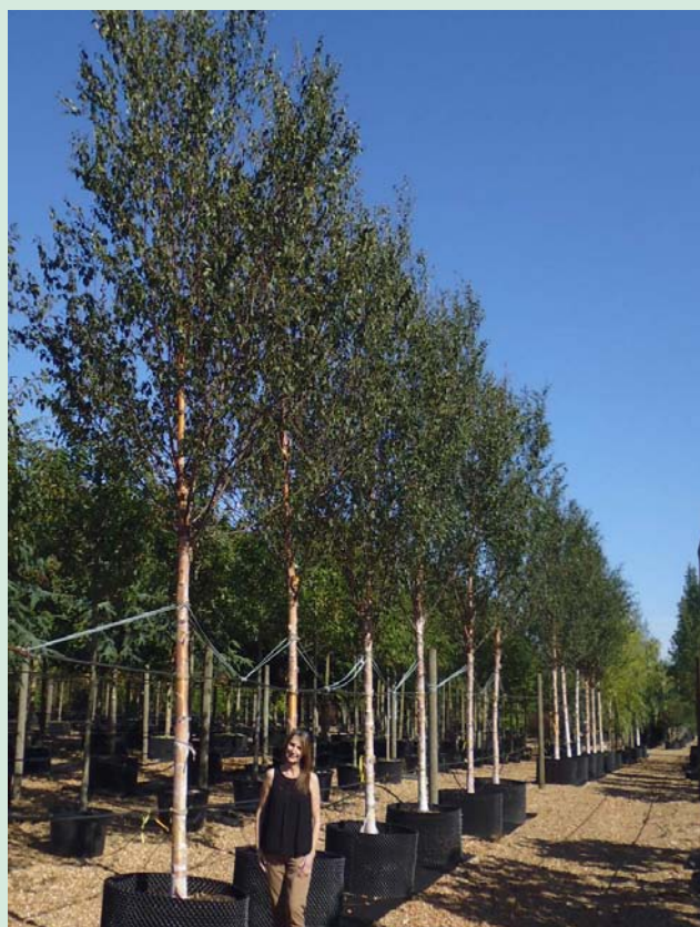
Upright uniform habit of Chinese Red Birch