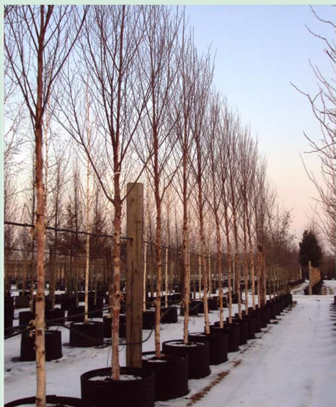
Betula Fascination bark, stunning in winter

Betula albosinensis Fascination is a beautiful tree which makes a great alternative to the commonly used Betula Jacquemontii .