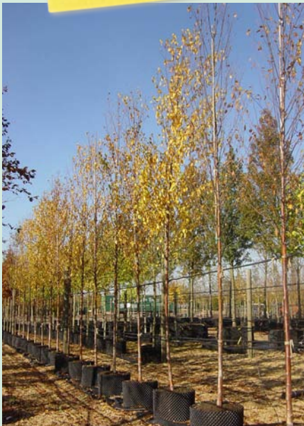
Golden autumn colour