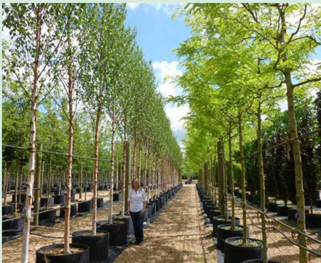
Betula Fascination , semi mature standards