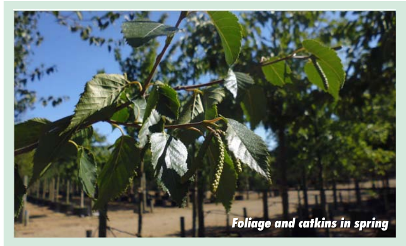
Foliage and catkins in spring

Deepdale Betula albosinensis Fascination was originally classified as Betula utilis