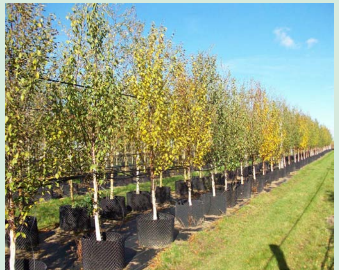
-4m feathered specimens in air-pots