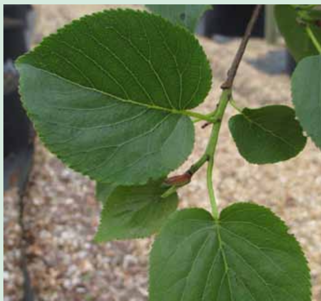
Heart shaped (cordate) foliage