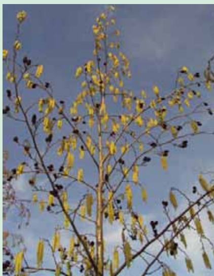
Italian Alder in spring