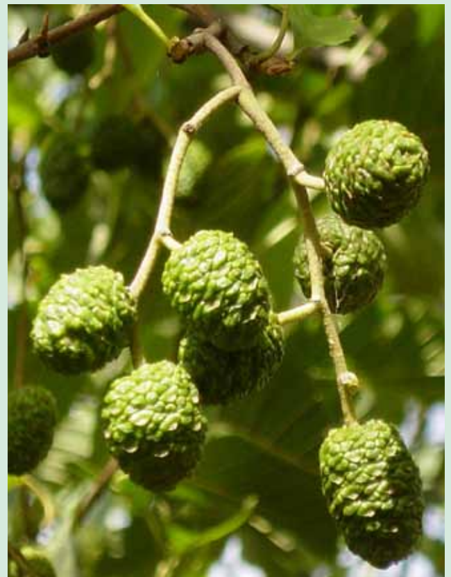
The juvenile cones in summer

Fruit: Female catkins develop into small woody cones which remain on the tree through winter