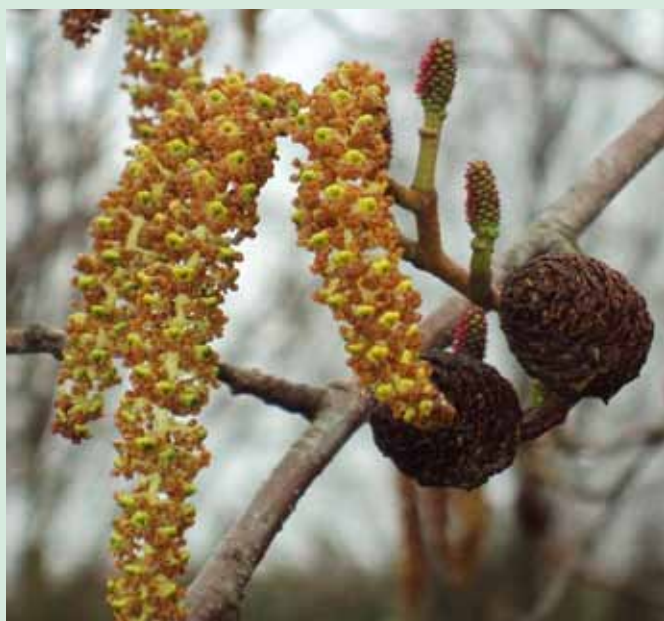
Male, female catkins and old cones