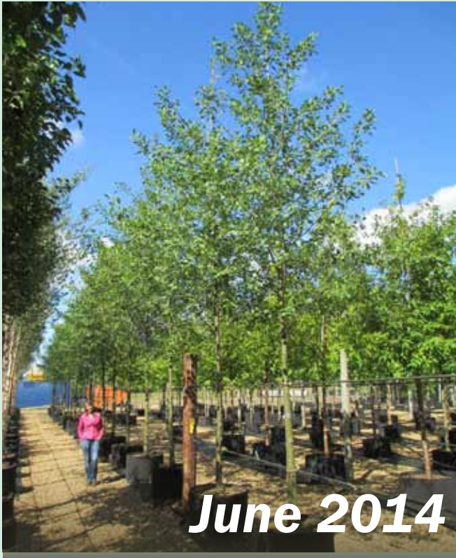
Alnus cordata 25-30cm girth standards in air-pot

Alnus cordata is a handsome tree, native to Southern Italy. It is fast growing, conical in form and ideal for parks, gardens and urban environments where space allows.