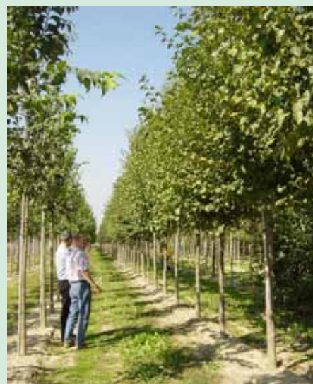
Field grown Italian Alders