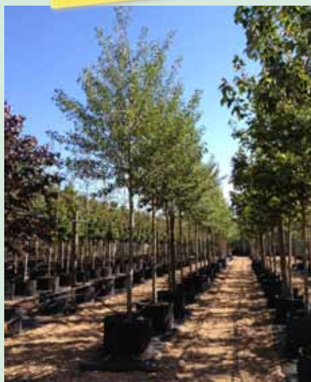
Semi mature Alnus cordata 20-25-30cm girth