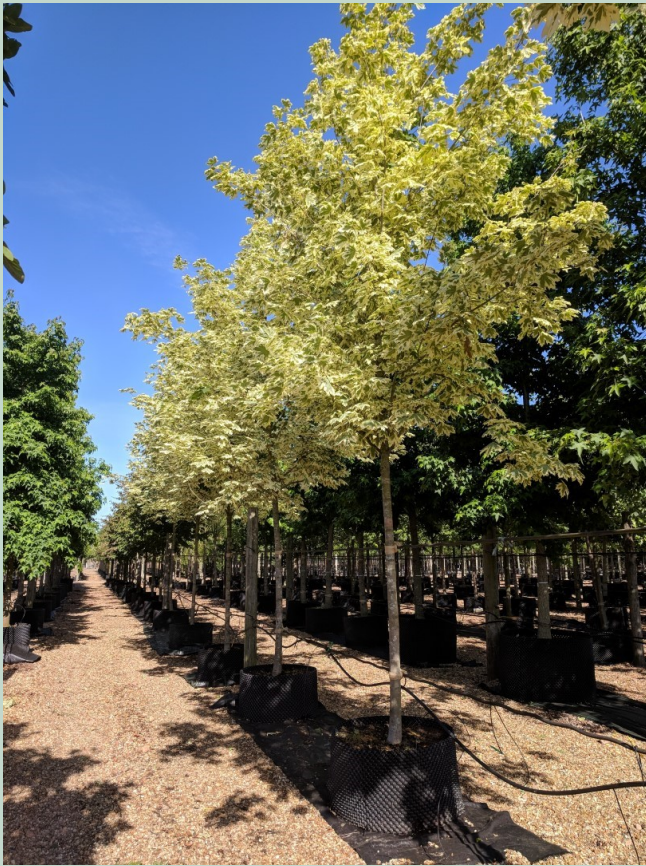
Acer platanoides Drummondii 20-25cm CG

Acer platanoides Drummondii is a sensational form of the Norway maple. It is probably the most best known variegated tree, and boasts deeply green lobed leaves with a creamy margin. This light foliage works well to contrast against darker leaved trees in the garden and can also provide an excellent focal point.