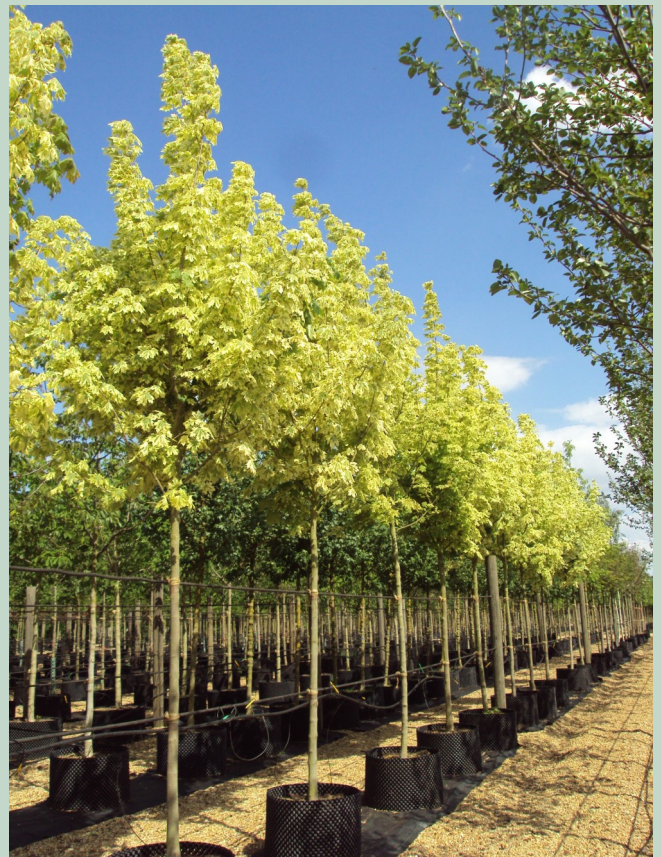
Not Acer platanoides Drummondii 18-20cm CG

Foliage: Variegated leaves with green centre and creamy white margins.