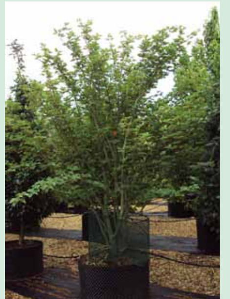
3m multistem Acer davidii