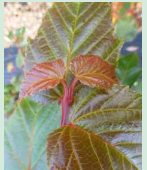
Acer davidii spring growth