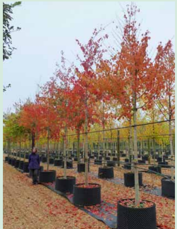
Fiery autumn display from Acer davidii

Bark: Green and white striped attractive bark. Make sure it is planted somewhere the bark can be admired!