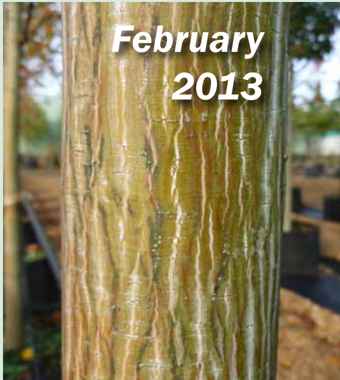
Beautiful bark of Acer davidii

This beautiful small tree which develops a spreading crown of arching branches, is one of the best of the 'snakebark' maples.