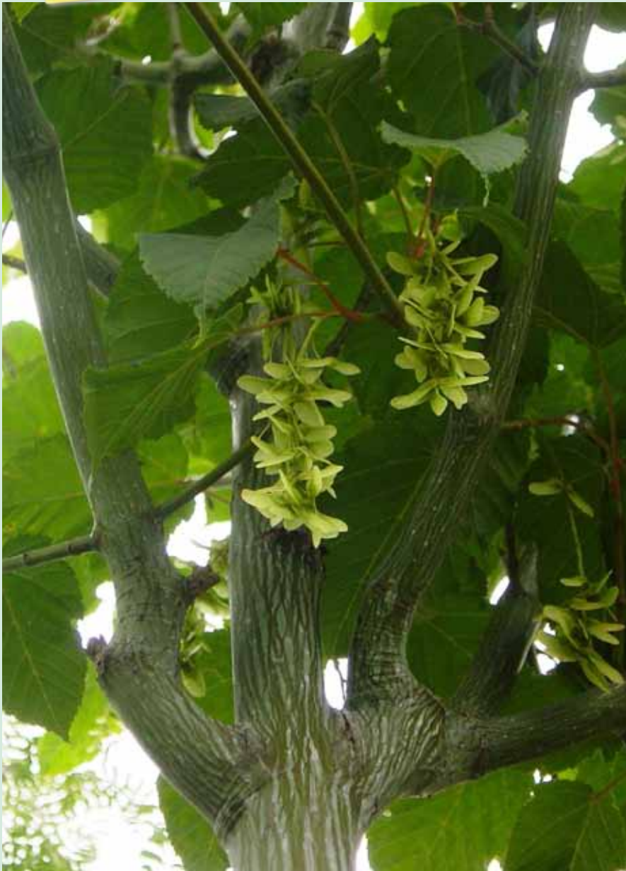
The bark and fruit of Acer davidii