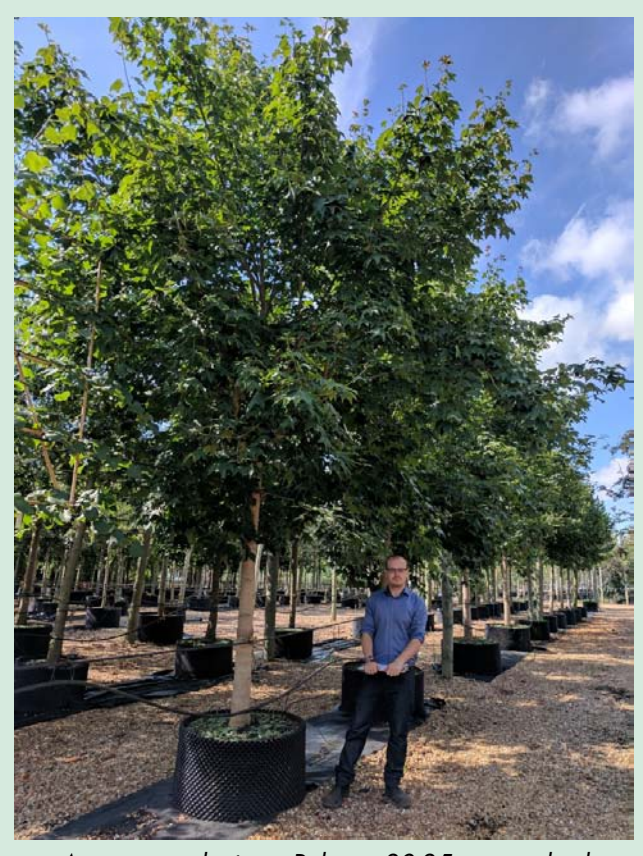
Acer cappadocicum Rubrum 30-35cm standard