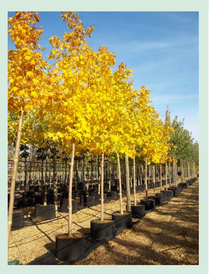
Acer cappadocicum Rubrum 16-18cm Standard