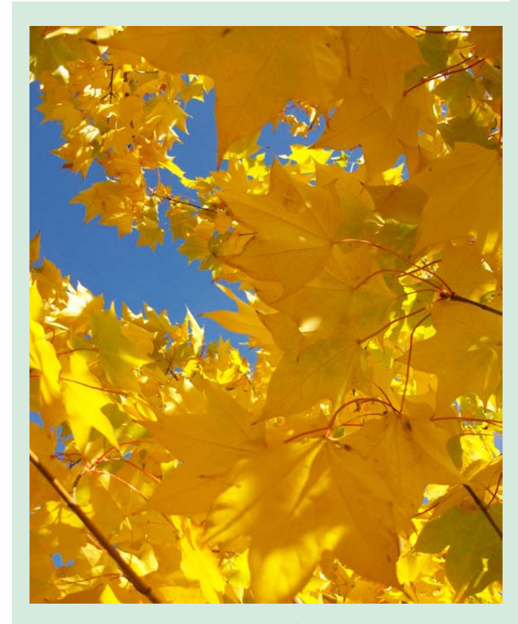
Acer cappadocicum Rubrum in Autumn