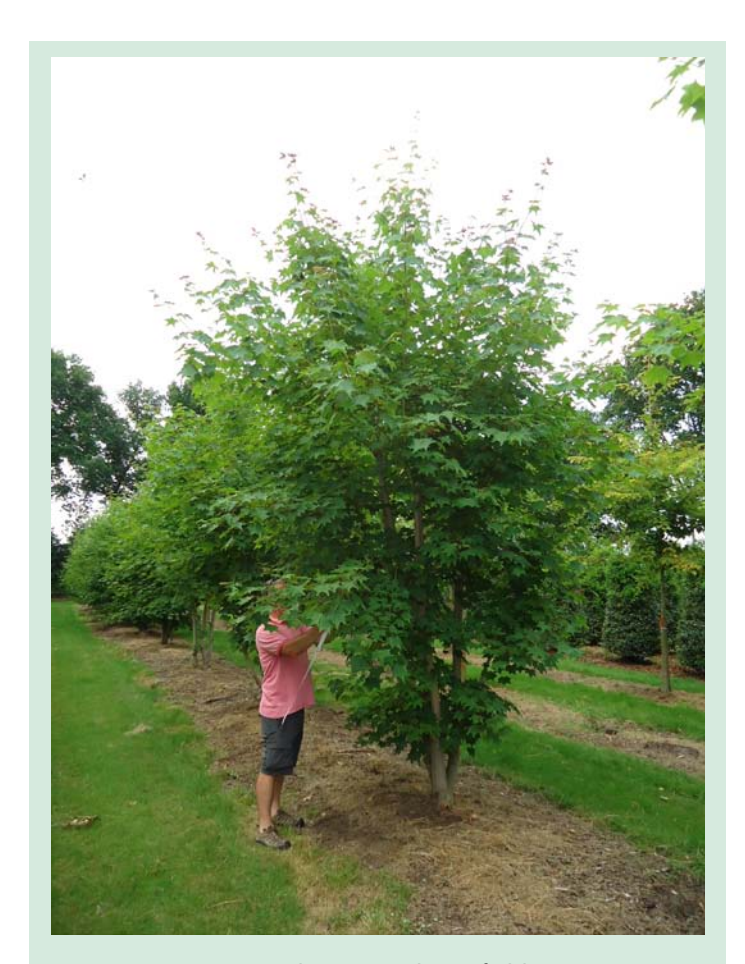
Acer cappadocicum Rubrum field grown

Acer cappadocicum Rubrum is a majestic tree/shrub that has a neat, round canopy. The 5-lobed leaves are a lovely plum colour at first, turning to green in the summer and gradually turning yellow in the autumn before they drop.