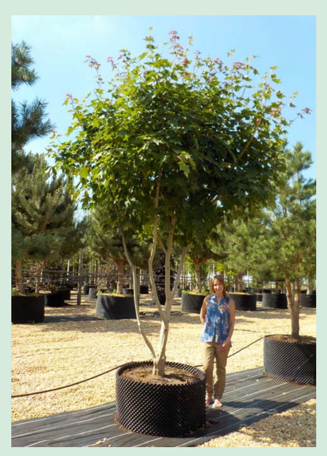
Acer cappadocicum Rubrum 3.0-3.5m umbrella