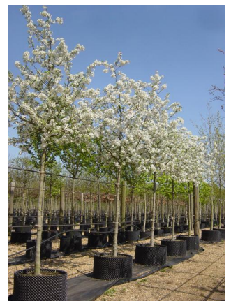
20-25cm girth standard