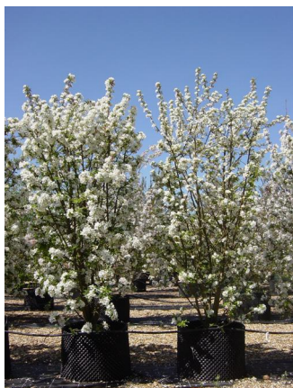
2m instant hedging

Malus Evereste is another very versatile plant which is available from Deepdale Trees in many forms, including: standard, multistem, umbrella, roof shape, instant hedage.