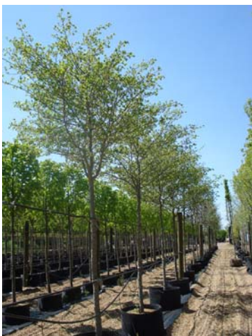
20-25cm girth Standard

This tree is a good choice for coastal and urban planting and is tolerant of pollution. It grows well in most soil conditions including dry and wet.