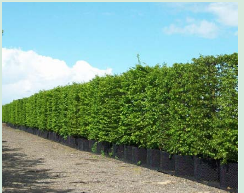
3m Instant Hedging Elements