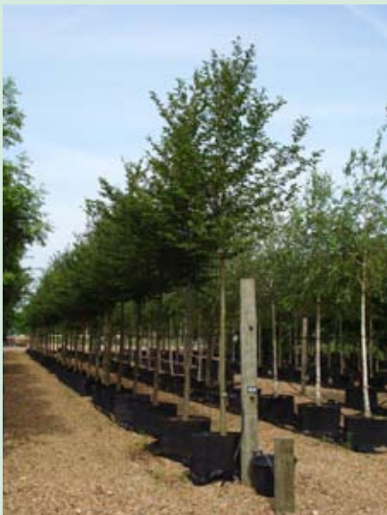
Standard 18-20-25cm girth