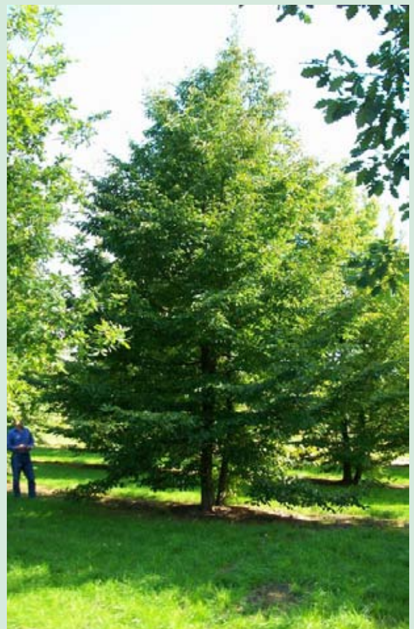
8-10m feathered Carpinus